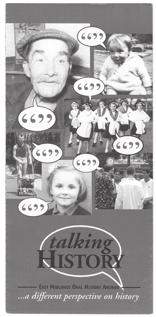
Figure 1: East Midlands Oral History Archive leaflet.

Our first project, which was funded by the British Academy (see figure 2), aimed to address the lack of a systematic survey of dialect in the East Midlands by examining vernacular speech in the region using data primarily from the East Midlands Oral History Archive (EMOHA).