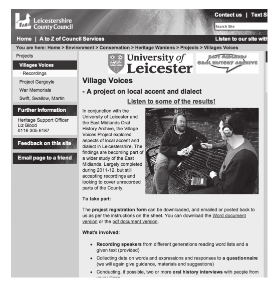
Figure 3: 'Village Voices' webpage.

induction process merely because they volunteered later than others or were not available on the training day. The timing for joining the project was approached quite flexibly to encourage maximum participation, and in fact the project remains open to possible additional villages. The villages that have already taken part are Coleorton, Thringstone, Frisbyon-the-Wreake, Moira and Lubenham, involving a total of twenty-two local informants (fourteen male and eight female).