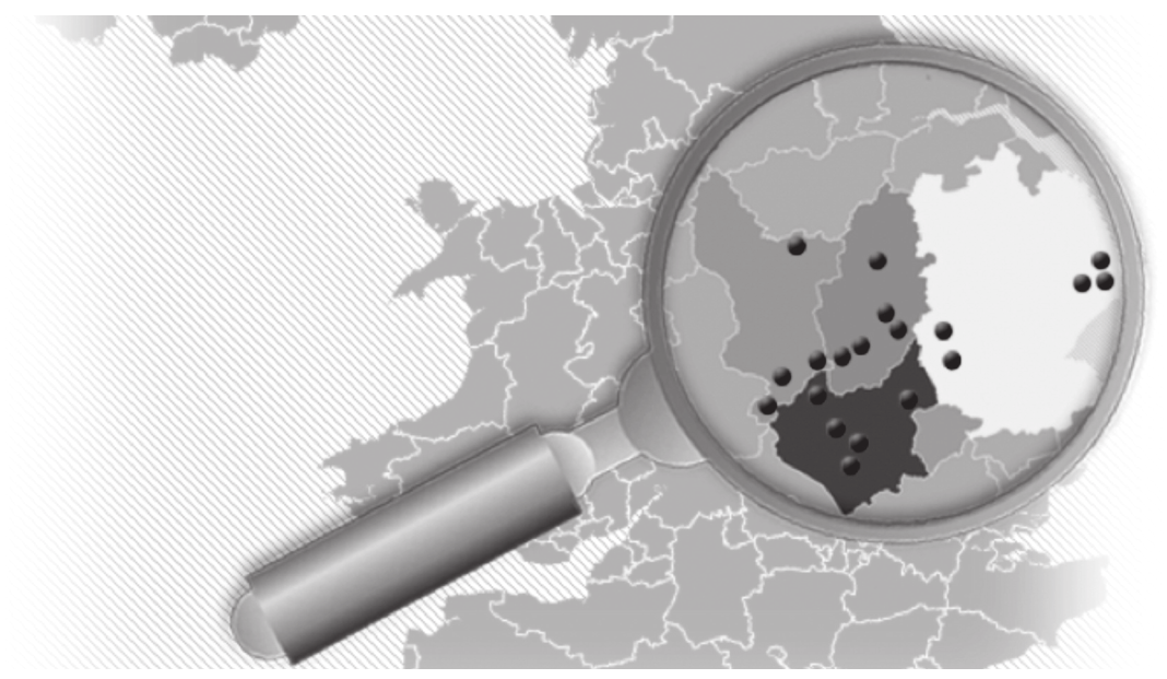
Figure 2: Locations of speakers (see www.le.ac.uk/emoha/community/dialect/home.html).

there is not an even spread across the region, and there is less material from Rutland, Derbyshire and Notting-hamshire than from Leicestershire. The interviews are all catalogued so, for the most part, there is an indication of family background and circumstances of the interviewee.