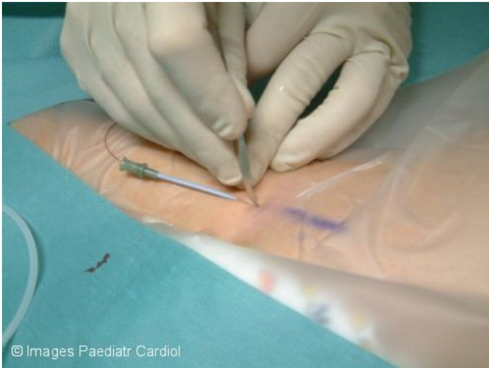
Fig 9 Thereafter, the chosen central venous line may be inserted over the wire.