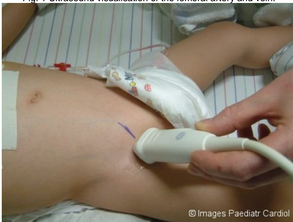
Fig. 1 Ultrasound visualisation of the femoral artery and vein.

The femoral vein lies medial to the femoral artery (around 0.3-1 cm, figs. 1,2) puncture site is about 1-3 cm below the groin. The tip of the catheter should lie either in the inferior vena cava downstream from the level of the renal vein, or above the diaphragm in the right atrium. The latter position will be indicated if measurement of right atrial pressure or repeated blood sampling from the atrium is indicated. This higher position however has a higher incidence of thrombosis – especially renal vein thrombosis. Therefore in the majority of the cases the more peripheral position of the catheter tip is chosen.