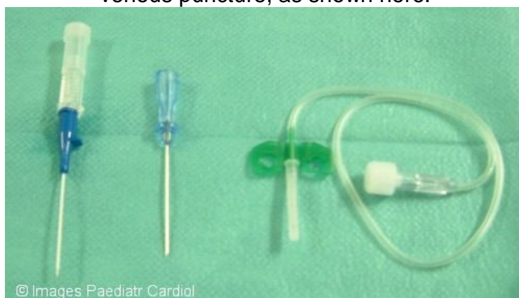
Fig. 4 A wide variety of needles and cannulae may be employed for femoral venous puncture, as shown here.

The femoral artery is palpated with one hand, then the skin is usually punctured 0.3-1 cm medially. The needle is advanced at a 30-40° angle to the skin towards the umbilicus. If the insertion angle is too steep the needle may transfix the vessel, and the guide wire cannot be threaded into the vessel. Different needles (fig. 4) and puncture techniques are in use: