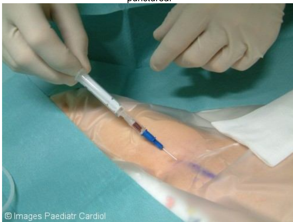
Fig. 5 Puncture technique: Gentle aspiration of the cannula with a syringe during puncture results in blood being aspirated when the vessel has been punctured.

After the insertion of the guide wire, the skin needs a small incision and a dilator is introduced and finally the catheter positioned and sutured.