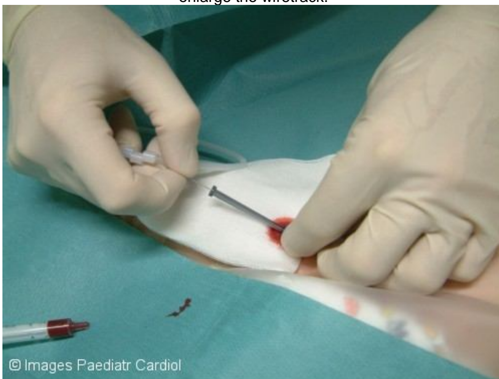
Fig 8 In some instances, it may also be necessary to make a small skin incision with a scalpel.