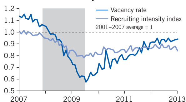
US vacancy rates have recovered, but recruiting intensity has not

When hiring new workers, employers use a wide variety of different recruiting methods in addition to posting a vacancy announcement, such as adjusting education, experience or technical requirements, or offering higher wages. The intensity with which employers make use of these alternative methods can vary widely depending on a firm's performance and with the business cycle. In fact, persistently low recruiting intensity partly helps to explain the sluggish pace of the growth of jobs in the US economy following the Great Recession of 2007–2009.