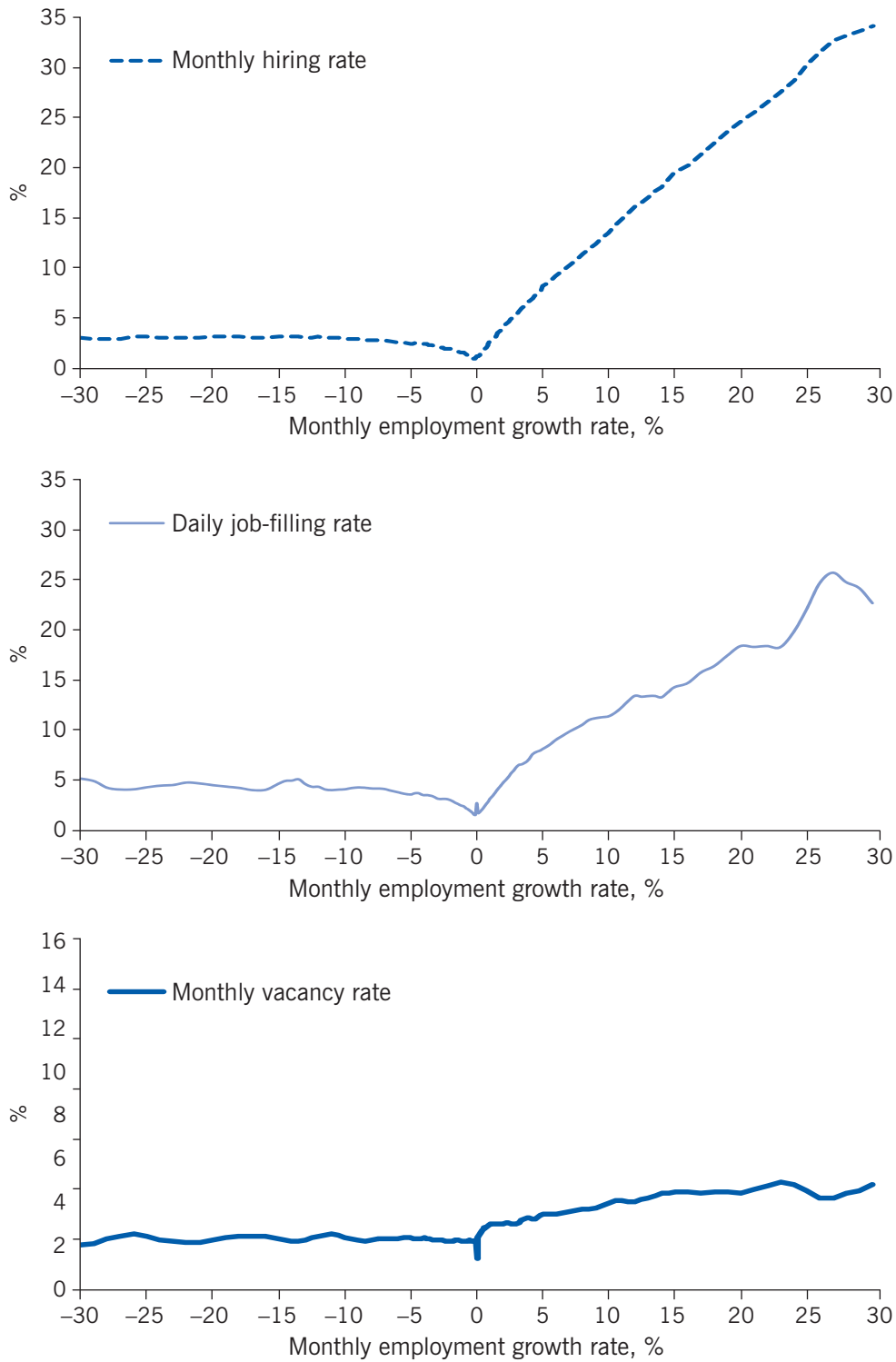
Figure 2. Hires, vacancies, and job-filling by employer growth

Note: The hiring rate refers to total hires during the month as a percentage of establishment employment. The vacancy rate refers to total vacancies open at the beginning of the month as a percentage of employment. And the job-filling rate refers to the average fraction of vacancies filled per day.