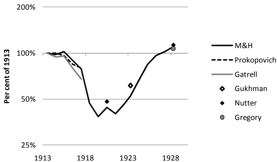
Chart 2. Russian and Soviet real national income, 1913 to 1928: New and old estimates, per cent of 1913

After that, there was a marked slowdown to single-digit growth. In 1927/28 aggregate output was around 10 percent larger than in 1913 on the same territory. At this point the composition of national income by sector of origin was almost the same as it had been 1913; this is found by comparing the first and last rows of Table 17. There were two important differences, however. One was the growth of large-scale industry, mostly under public ownership, at the expense of small-scale industry under mostly private ownership. Another was a decline in the share of military activities by more than one half. This was hardly sustainable, given Soviet Russia's state of military encirclement— both real and imagined – in the late 1920s.