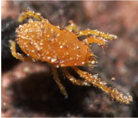
Figure 3a. Photograph of an alive Labidostomma (Cornutella) cornutum specimen (male)