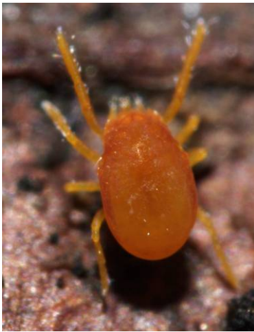
Figure 3b. Photograph of an alive Labidostomma (Nicoletiella) denticulatum specimen (male)