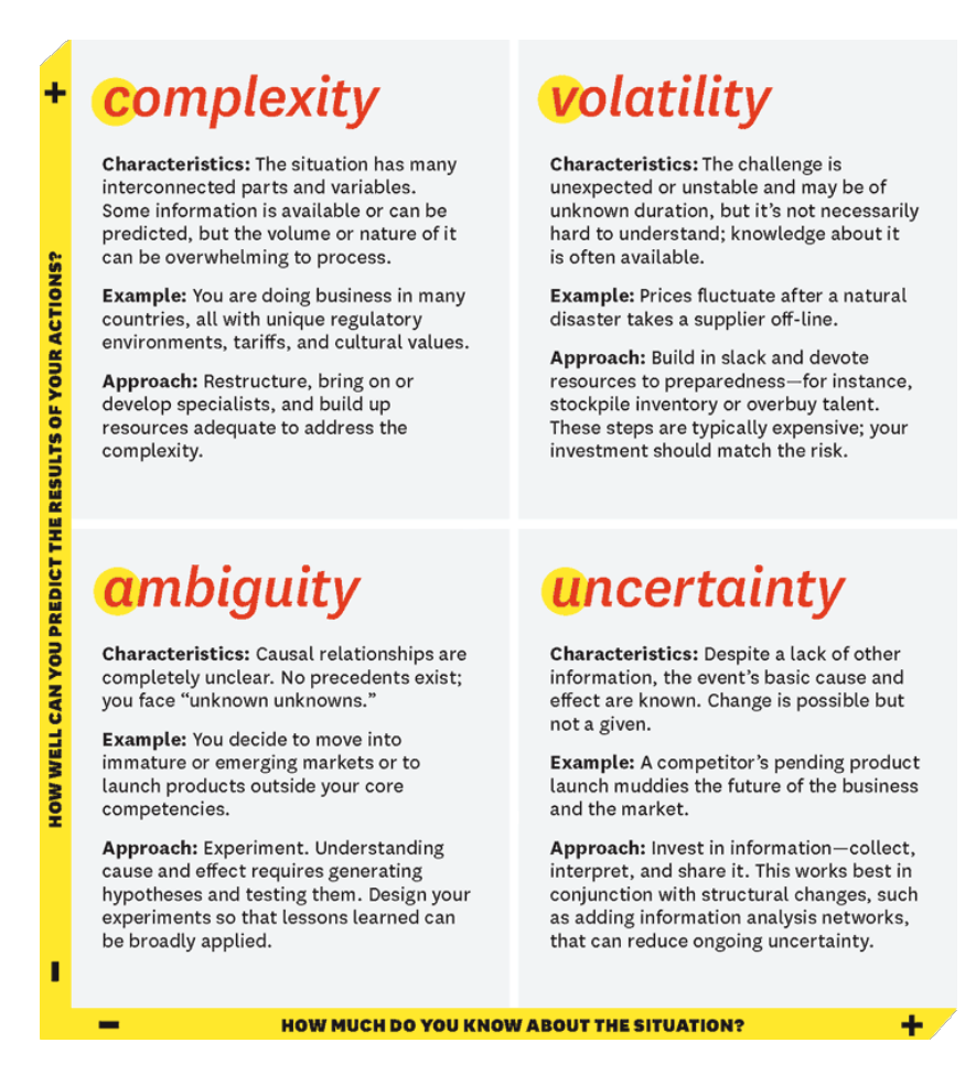
Figure 1. Depiction of VUCA Concept. 19