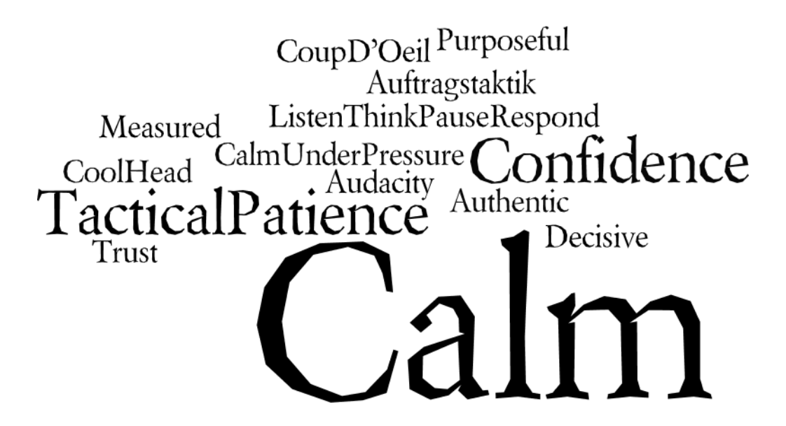
Figure 3. Word Cloud of Answers to Question 19.75