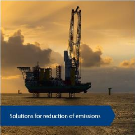
Solutions for reduction of emissions