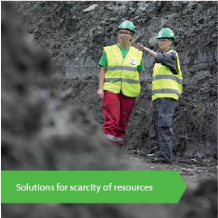
Solutions for scarcity of resources

DEME has a leading position in a number of highly specialized and complex hydraulic disciplines. In the next decades, the world will be facing major challenges such as the effects of climate change and scarcity of resources. Through innovative thinking DEME is offering sustainable solutions in response to these future needs in various fields such as soil and sediment remediation, water treatment, coastal protection, development of green and blue energy, offshore dredging of gravel and sand, deep sea harvesting of minerals and creation of land in densely populated regions and ports and industries.