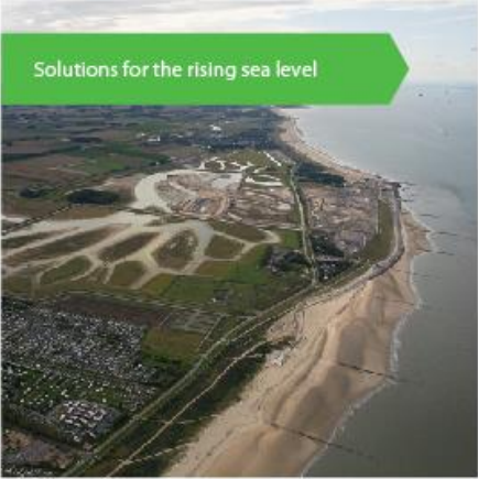
Solutions for the rising sea level