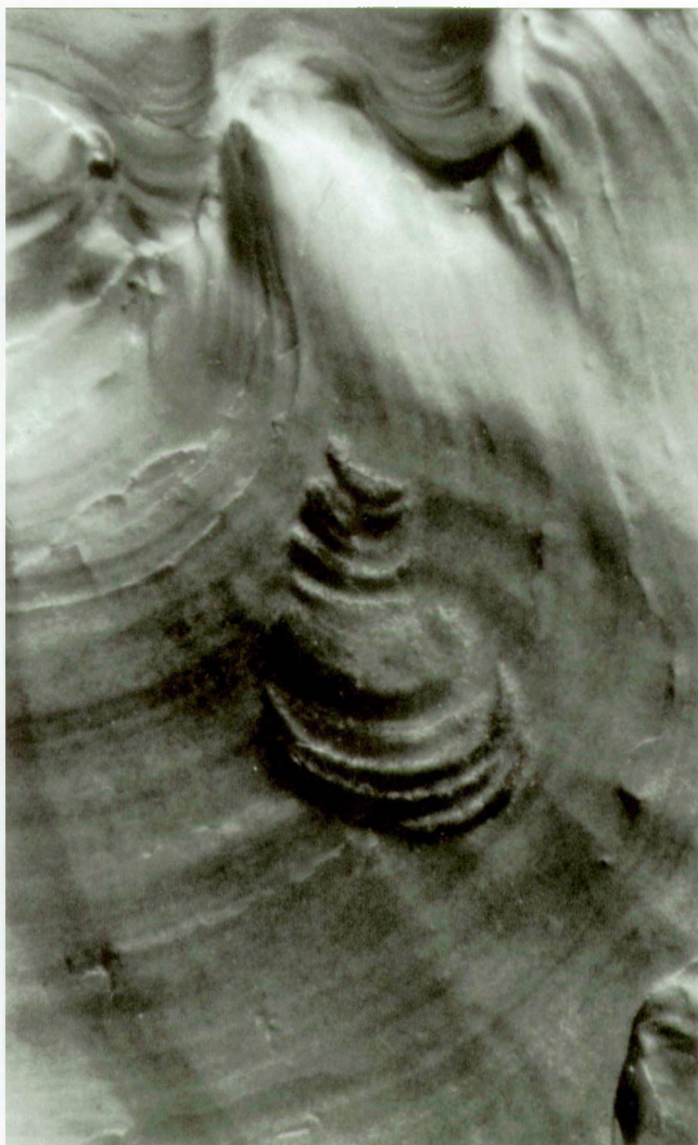
Fig. 1 — Centrichnus eccentricus near the umbo of a pycnodonteine oyster [ Pycnodonte vesicularis (LAMARCK, 1806)], NHMM JJ 12110 (leg./don. Y. Coole); CPL SA quarry, Haccourt (Liège, Belgium); Gulpen Formation, base of Vijlen Member + 2-6 m (upper Lower Maastrichtian), x 10.