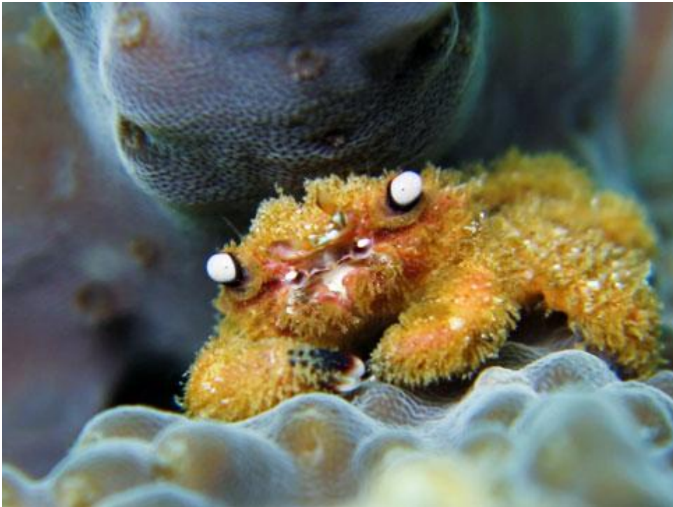
Fig. 1 Cymo melanodactylus on Acropora

6 Warwick House, Sutton Coldfields, West Midlands, UK