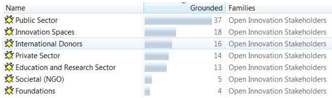
Figure 1: Types of Stakeholders Supporting Open Innovation and ICT Entrepreneurship

Figure 1 below provides an overview of the types of stakeholder groups articulated by the informants.