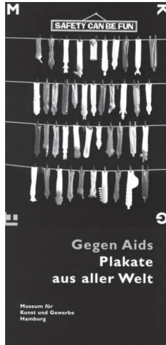
Figure 1: The leaflet (10 × 21 cm) for ‘Against Aids: Posters from around the World’, Museum für Kunst und Gewerbe , Hamburg, 2006.