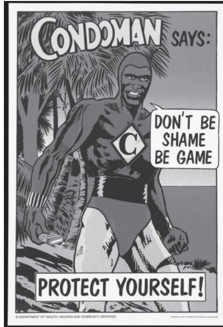
Figure 2: Issued by the Commonwealth Department of Community Services, Aboriginal Health Workers of Australia (Queensland), 1991 (41 × 28 cm). This poster was reproduced in several countries with the English translated.

still had the power to shock, titillate, and/or amuse (such as that used on the front of the flyer for the exhibition, Figure 1, or ‘condoman’, Figure 2). In part to enhance these effects, realist anti-homophobic posters (Figure 3), were mixed with erotic ‘body-beautiful’ ones, such as ‘Semen Kit’ (Figure 4). Posters were also connected through novel imagistic and ironic associations. ‘Semen Kit’, for example, joined nautical space with a poster of a condom disguised as a life-saving ring, 17 which, in turn, was hung alongside a Russian poster advert for rubber tyres. These striking juxtapositions were intended to reveal the variety of aesthetic choices that governments, charities, commercial bodies, and private artists employed in their efforts to inform the public of the threat of HIV/AIDS and incite onlookers to ethical behaviour (safer sex). Dramatically, at the entrance to the exhibition, the visitor was confronted with a full billboard-size reproduction of Oliviero Toscani’s iconic image of 1992: his re-conception of the prize-winning photograph from Life depicting the death of the American AIDS activist David Kirby, turned into an advertisement for the United