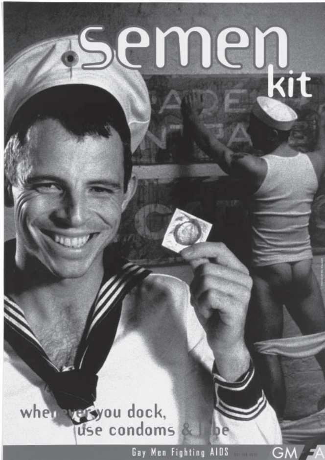
Figure 4: Issued by 'Gay Men Fighting AIDS', London, 1994 (59 × 42 cm), Hywel Williams photographer. Courtesy of the Wellcome Library, London. The image was reproduced on a 15 cm card, which was handed out at the Gay Pride festival in July 1994. The text on the card mentions the UK government's poor funding of safe sex campaigns and Parliament's homophobic reaction to the proposal of an equal age of consent of 16 for both hetero- and homosexuals.