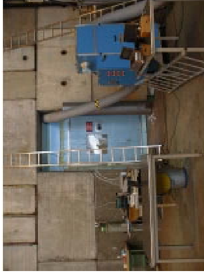
Fig. 1 : Concrete shack for validating the computer fluid dynamics calculations for an accidental spill of liquid argon in the Hall 180