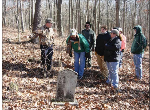
Figure 6. Participants in a weekend workshop visit the grave of William Bransford while learning about the history and contributions of African Americans to the Mammoth Cave area.