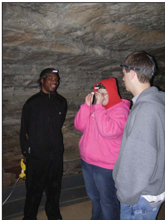
Figure 8. A Special Topics in Biology II high school class learns cave mapping techniques and how cave mapping is used as an important scientific tool in the management of cave resources.

of resources found at the park while working alongside researchers. Several advanced high school classes have also participated in research-focused outdoor learning experiences with MCICSL staff. In addition, MCICSL and Tennessee State University have partnered on an NSF grant encouraging minorities to pursue science, technology, engineering and math careers. The partnership is using cultural connections to the park as a way to connect the students with the park's geoscience and environmental resources.