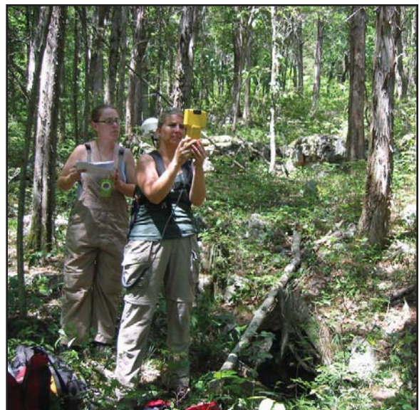
Figure 7. Two Geoscience-Teacher-in-the-Park interns assist park scientists by recording the GPS coordinates of a newly discovered cave entrance.

For the past three years, MCICSL has collaborated with Mammoth Cave’s Environmental Education Division and the National Association of Geoscience Teachers to offer summer internships for local teachers. The teachers gain hands-on exposure to the variety