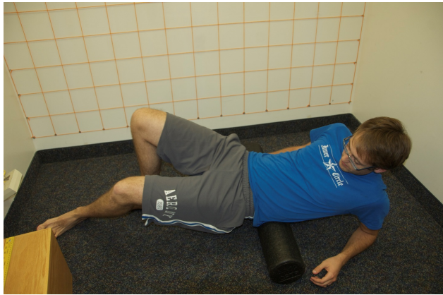
Figure 2a. Foam rolling – low back.

post-treatment 1, and post-treatment 2; see Table 2).