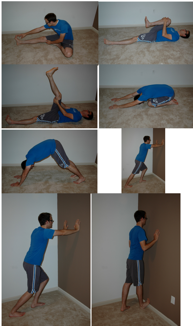
Figure 4. Static stretch. a. Hurdler's stretch. b. Butt/hamstring. c. Supine hamstring stretch. d. Child's pose. e. Downward facing dog. f. Gastrocnemius. g. Soleus. h. Calf.

participants. The model included both treatment and crossover effects. The independent variables were the treatments that were used and the order in which they were performed. The dependent variable was joint range-of-motion as measured by the sit-and-reach test. Data were analyzed using a Bayesian paradigm so posterior probabilities could be calculated.