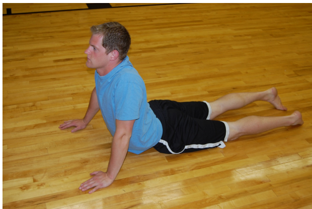
Figure 3d. Postural alignment exercise – cobra.

using their own body weight to provide pressure (see Figures 2a-e). The postural alignment exercises (7) were repeatedly performed for 10 minutes (timed by the exercise leader) and included the following: cobra on elbows, upper spinal floor twist, static extension position, cobra, sitting floor twist, pelvic tilts, and cats and dogs (see Figures 3a-g). The static stretches (4) were