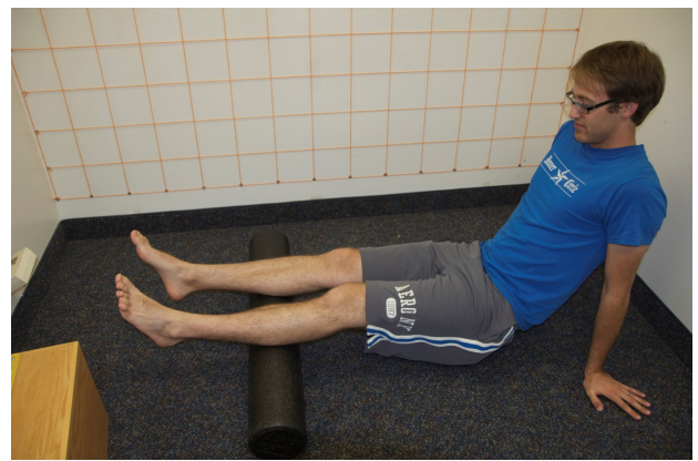
Figure 2e. Foam rolling – calves.