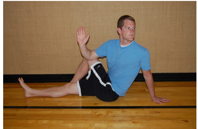
Figure 3e. Postural alignment exercise – sitting floor twist.

also repeated for 10 minutes and included the following: hurdler's stretch, butt/hamstring stretch, supine hamstring stretch, child's pose, downward facing dog, gastrocnemius stretch, soleus stretch, and calf stretch, (see Figures 4a-h).