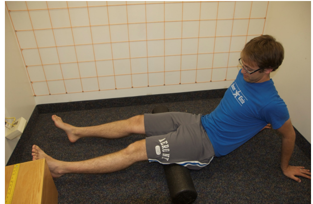
Figure 2d. Foam rolling – hamstrings.

The foam-roll treatment consisted of using a cylindrical foam roller (6" circumference by 36" long; model: AXIS; OPTP, Minneapolis, MN) made of densely packed foam (5). Participants foam-rolled various muscle groups (4) that could potentially