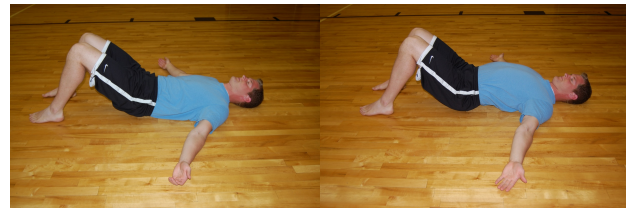
Figure 3f. Postural alignment exercise – pelvic tilts.