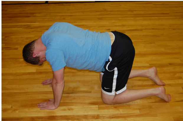
Figure 3c. Postural alignment exercise – static extension position.