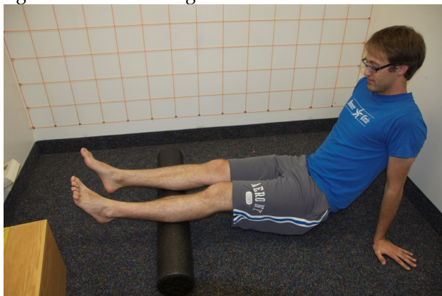
Figure 2b. Foam rolling – calf.