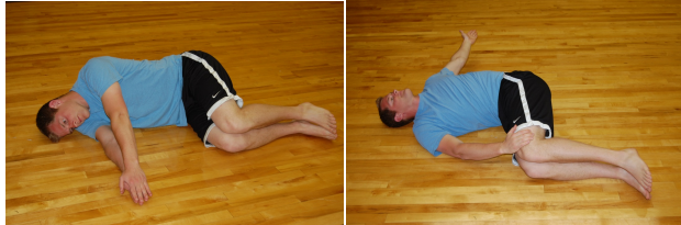
Figure 3b. Postural alignment exercise – upper spinal floor twist.