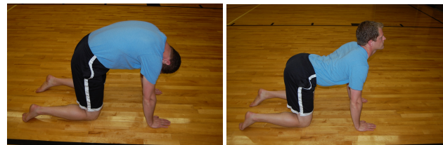
Figure 3g. Postural alignment exercise – cats and dogs.