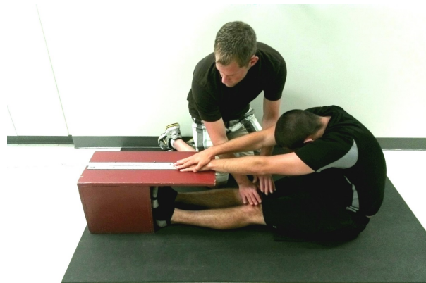
Figure 1. Sit-and-Reach.

TN; see Figure 1) with the participant sitting on the floor with legs extended and the soles of the feet against the sit-and-reach box at the 10-inch (25.4-cm) mark (16). For each test trial, participants were instructed to slowly reach forward with both hands as far as possible (refraining from fast, jerky movements), and to hold the maximal reach position for 1–2 seconds.