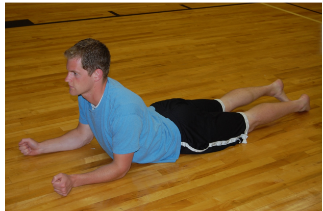
Figure 3a. Postural alignment exercise – cobra on elbow.

affect the sit-and-reach test: low back (erector spinae), upper back, buttocks (gluteus maximus and piriformis), posterior thigh (hamstrings), and calf (gastrocnemius and soleus). Participants spent a total of 10 minutes foam-rolling these muscle groups