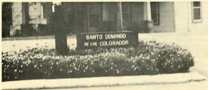
Bowling Green will have 16 visitors from its sister city, Santa Domingos de los Colorados. The visit is a joint effort of Partners of the Americas and Sister Cities.

It started as a round table discussion by the Chamber of Commerce. The Tourism Department picked it up and kicked the idea around. Now Jubilee '84 will soon be a reality with Western playing a part in its success.