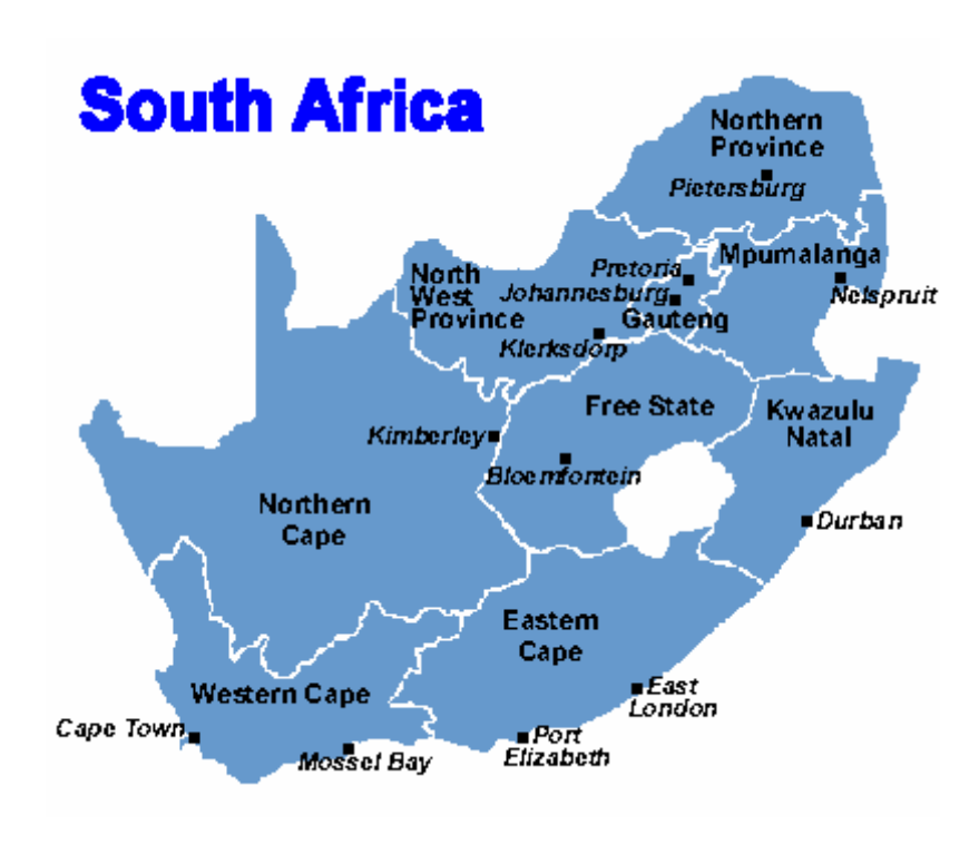
Figure 1. Shows the map of South Africa including the Mpumalanga Province.