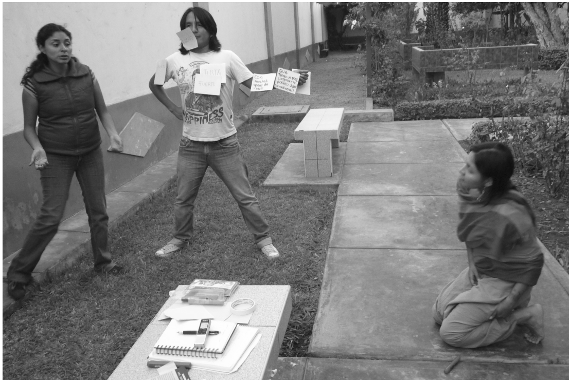
Figure 1 Ñoqanchiq sociodrama