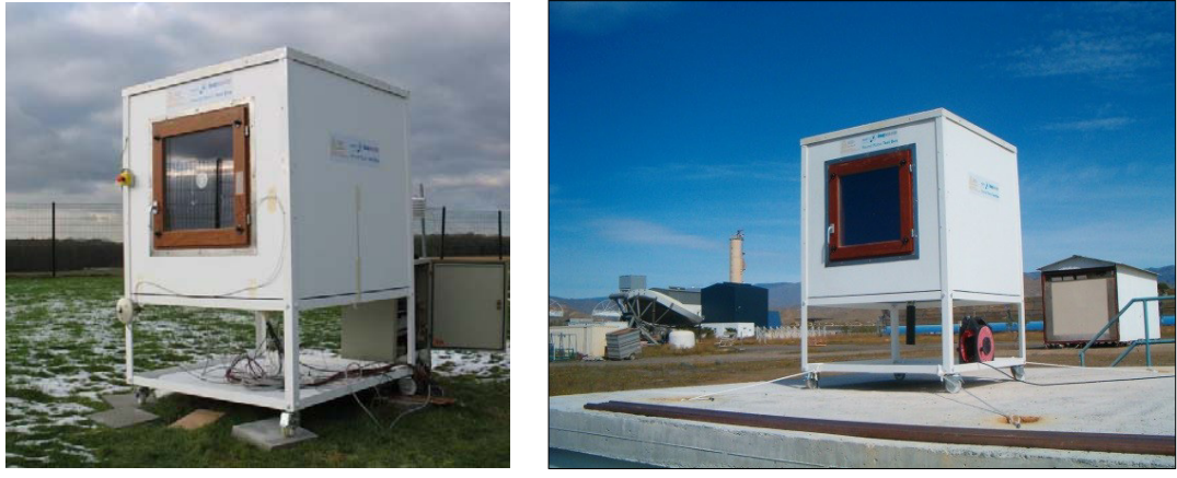
Figure 1. Test box during winter at the measuring site at BBRI. Belgium (left) and during summer at the Plataforma Solar de Almeria, Spain (right).

other hand is dry and extremely hot in summer, with large temperature amplitudes between day and night. During day time, solar radiation is very high on horizontal surfaces and the sky is usually very clear. Figure 1 shows the test box at both sites.