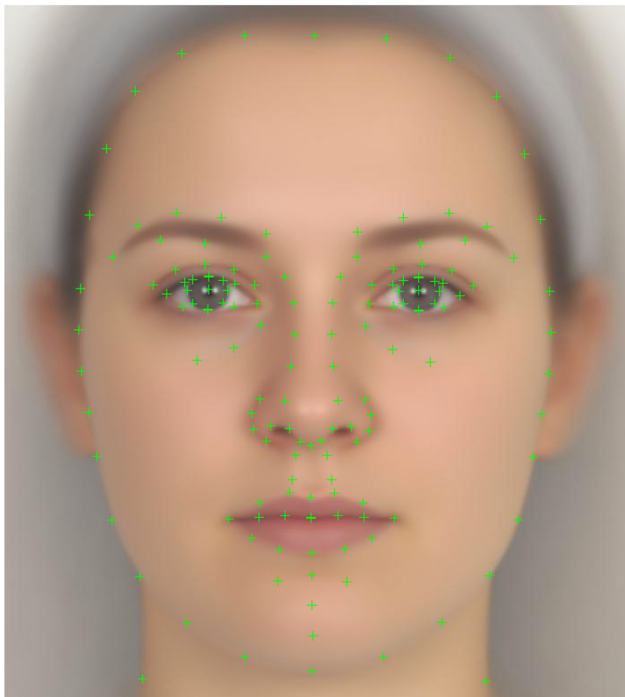
Fig 2. Landmark points. The 154 landmark points on the average of all 526 faces.