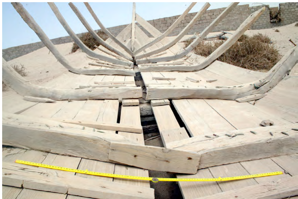
Figure 14. The space between the garboard strakes of the hūrī into which the keel will ultimately fit is kept uniform using string to prevent the strakes from parting (above), or chocks, which lock them in place (below).

additional futtocks. The process is neither entirely frame-first nor plank-first, but a mixture of the two, with the overall shape determined by eye, and realised through the build-up of futtocks and planking.<sup>46</sup> In both cases, the keel and floors are largely incidental to the