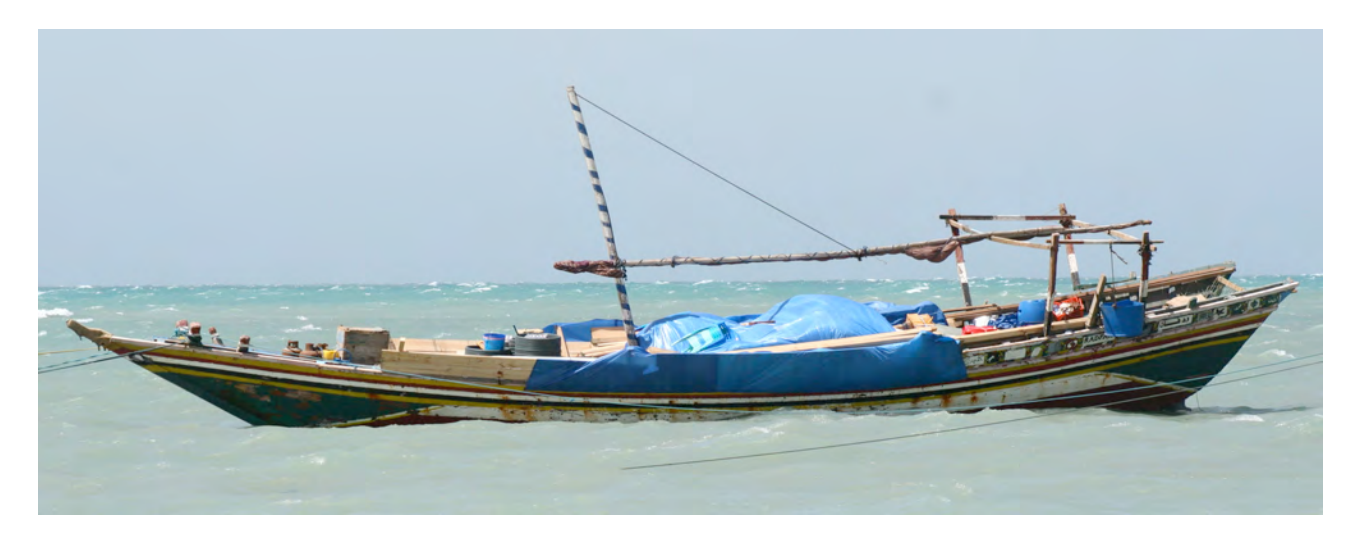
Figure 3. A large "winged" hūrī in the sea at al-Khawkha.