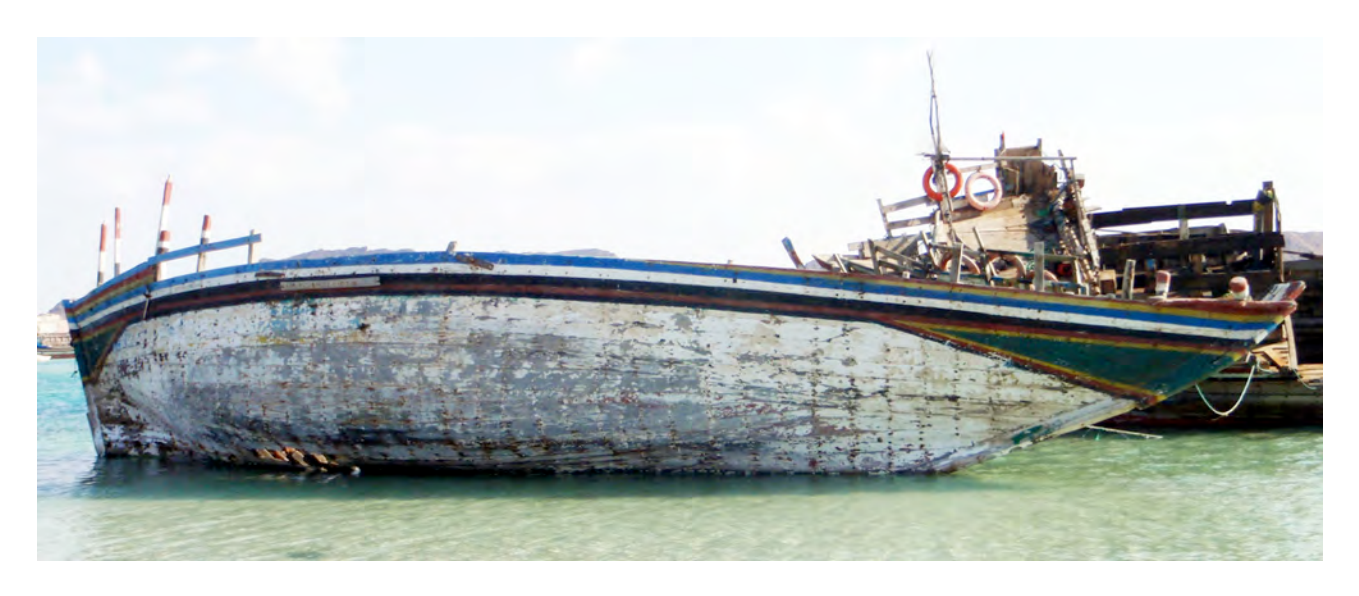
Figure 6. A za ima at Khawr al-Ghurayra. (J. P. Cooper)

In the early twentieth century, both Moore<sup>33</sup> and Hornell<sup>34</sup> reported zaīma s observed at al-Hudeida and at Jedda, but their descriptions are vague and they provide no illustrations. In the 1960s, Pujo observed and photographed zaīma s in Djibouti. These were vessels up to 20m long with a capacity of 30 t and with the characteristic curved stem of the double-ended zaīma observed in Yemen by the present authors, but they had a transom stern.<sup>35</sup> Like many Arabic words applied to boat types, sanbūq has been applied to a wide variety of vessels. Hawkins observed during his visits to Aden that it was applied to almost any fishing boat,<sup>36</sup> while Prados noted that it was given to a type of small double-ended sewn fishing craft. <sup>37</sup> In terms of larger vessels, it was applied to those ocean-going cargo dhows that disappeared in the 1970s or 1980s. These had escutcheon-shaped transom sterns and upward-curving stemposts.<sup>38</sup> Originally having one or two masts, they later were converted to take an inboard engine. They were often highly decorated at the stern.<sup>39</sup> Similar to this type of sanbūq was the sāʿiya , described in the last century by Moore,