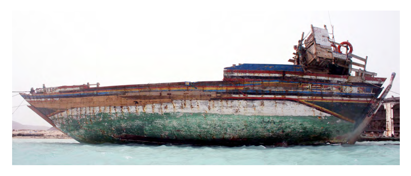
Figure 5. An abandoned zarūq at Khawr al-Ghurayra.

allow a prop-shaft to emerge into a space, forward of the stem-post, created for the propeller. The wash of the propeller passes over the stem-post and the rudder blade attached to it. The midships area is open to the hold, with decks fore and aft. The term 'obrī is not mentioned in previous literature on Yemeni craft, but craft is clearly the " ib'ri ( sic. )" whose construction Perrier describes,<sup>27</sup> and the vessel type is clearly the " sanbuq " encountered by Prados in the early 1990s<sup>28</sup>.