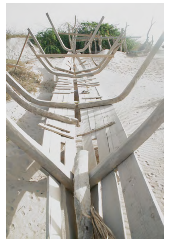
Figure 13. The hull of a hūrī in its early stages of construction: the planks have been heat-shaped and built up from the garboard strakes around five guide-futtock pairs. Note the absent keel. (J. P. Cooper)