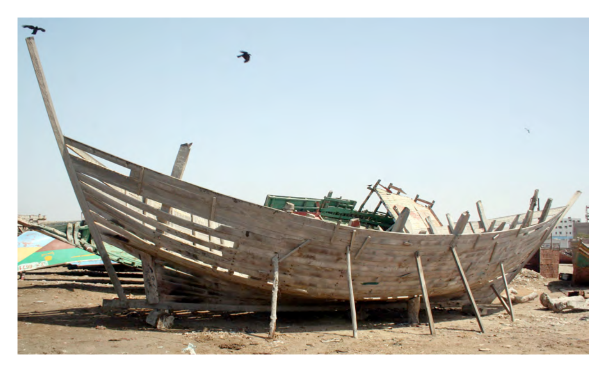
Figure 11. 'Obrī construction: as the hull strakes are built up and the hull shape established, additional framing timbers are installed, here starting from the bow (right in picture). Upper futtocks may be added to secure the highest strakes. (J. P. Cooper)

akhmās, sing. khums) are affixed at intervals along the keel. The shape of each futtocks is established using a bent wire in the desired curvature of the final futtock, which is laid on a naturally crooked timber, and the shape traced on. Thereafter the timber is trimmed to shape using an adze or electric saw. The akhmās pairs are then nailed to the garboard strakes: the spread of each pair is decided by eye, and symmetry maintained using string and plumb-bobs. Each pair is then held in place using cross-spawls and sometimes external props. At this point the builder starts to build up the hull planking, with adjacent planks held together using temporary battens and chocks (Figure 10). When the lower hull planks are in place, additional futtock pairs are installed, with floor timbers are alternating between these pairs and bolted to the keel. Upper futtocks are allocated to these as the hull planking ascends (Figure 11). Once the hull shape is thus established, internal stringers are attached, the inboard engine mounted, and the crossbeams, decking, and superstructure are added.