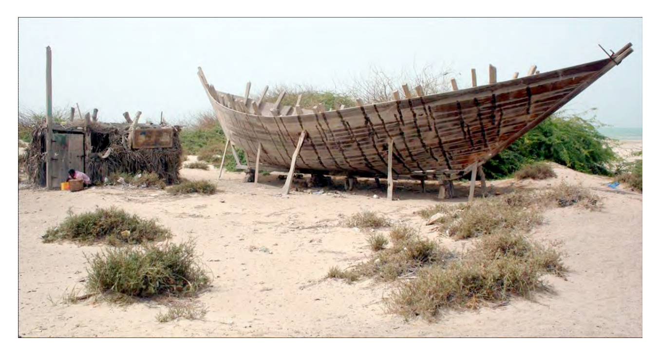
Figure 8. An artisanal boatyard at al-Khawkha, comprising a small carpenter's hut and open shelter, alongside an open-air boatbuilding area with an almost-complete, but abandoned, 'obrī.

locations visited. Many builders said that it had been several years since they had built an entire vessel. The only activity observed during the MARES fieldwork was in al-Hudeida, and involved the repair and replacement of the lower planking of a traditional wooden vessel, caulking the hull, and the application of wood preservation coatings to the outer hull.