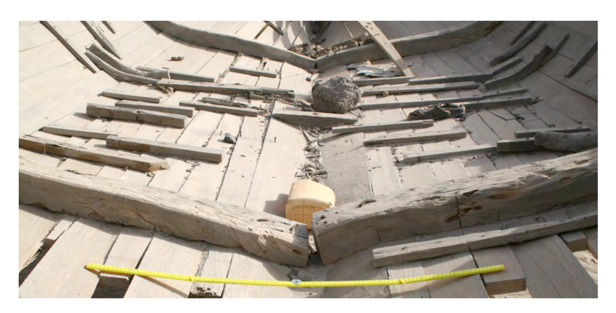
Figure 10. 'Obrī construction: adjacent strakes are held flush together using temporary battens and chocks. (J. P. Cooper)