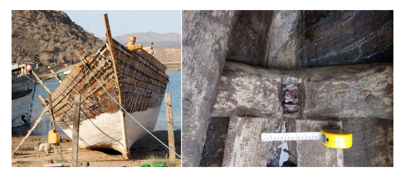
Figure 15. A za\bar{\imath}ma hull covered with white sha\dot{n}am , a mixture of animal lard and gypsum (n\bar{u}ra) (left). The traditional coating for inside the vessel is called s\bar{\imath}fa , a mix of shark oil, charcoal, and incense (right).

muraymara (Melia azaderach L.)<sup>49</sup> and damas (Conocarpus lancifolius Engl)<sup>50</sup> were used extensively as hull framing timbers, for the timbers of the stem and sternposts, and for the curved samaka (or kirda) timber that acted as the propshaft bearing in vessels with an inboard motor. Imported wood that fulfilled these functions included mītī, apparently from Somalia, and zur (or zann) from Asia. Another wood sometimes used for framing timbers was called locally dayman, but no more information could be gathered about it.