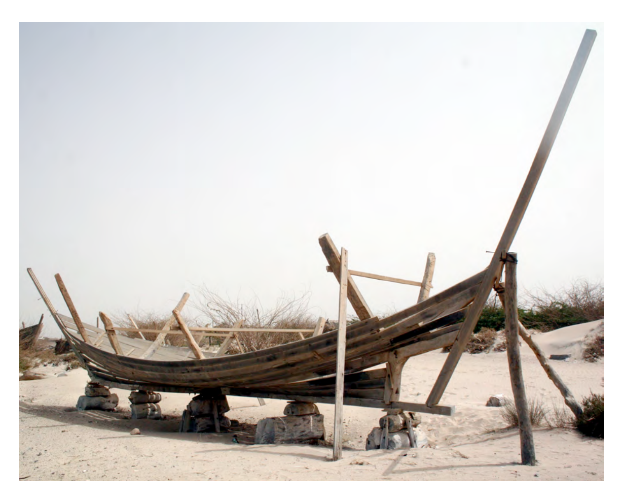
Figure 9. An 'obrī in its early stages of construction. The keel has been laid and rabbeted. The stem-post, stern-post and the L-shaped timber through which the propeller shaft will ultimately pass, also rabbeted, have been fixed in place. The four pairs of guide futtocks are visible, held in place by cross-spawls.