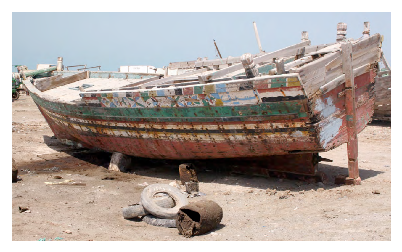
Figure 7. A bōt at al-Ḥudayda.

Hornell, Villiers and Prados.<sup>40</sup> No surviving material evidence of these s\bar{a} iyas was found during the survey.