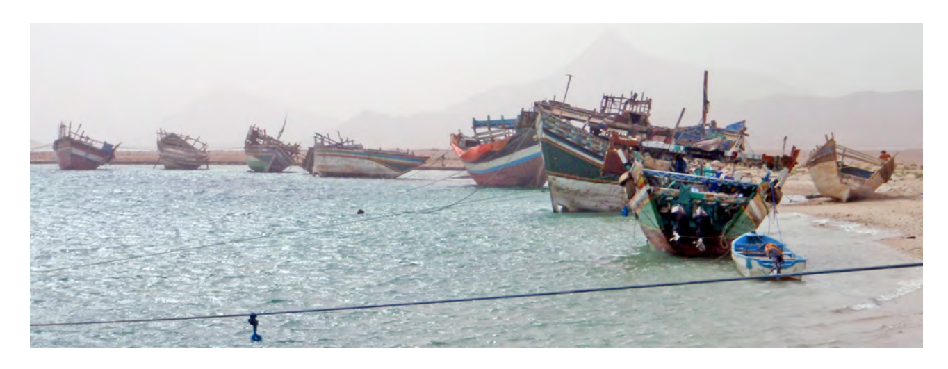
Figure 2. Vessels moored or abandoned in the creek of Khawr al-Ghurayra (C. Zazzaro)

Within the greater Aden area, members of the team visited the Inner Harbour at Maʿalla that was once the centre of the city's dhow-building and trading activity. Other small bays around the Aden peninsula were also visited, but it was only at Maʿalla, specifically Dakkat al-Ghaz, that evidence of dhows was found. On the al-Bureigha (Little Aden) peninsula, the team visited the fishing villages of Khisa and Fuqum, where abandoned dhows were also found.