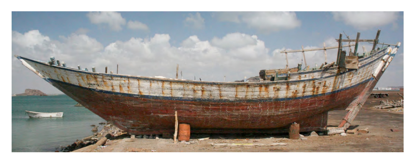
Figure 4. An 'obrī propped at Dakkat al-Ghāz, Ma'allā, 'Adan. (J. P. Cooper)

function, fishing. Already in the 1970s, Hawkins observed that Yemenis were applying the name to new, motorised fishing boats as the fishing industry expanded – though he does not describe these craft. <sup>26</sup> The name is widely applied today to small fibreglass fishing craft.