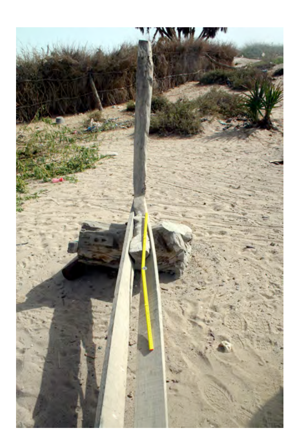
Figure 12. The first stage of construction of the hūrī: the garboard strakes have been heat-shaped, and are fastened at their ends to internal stern and stem knees.