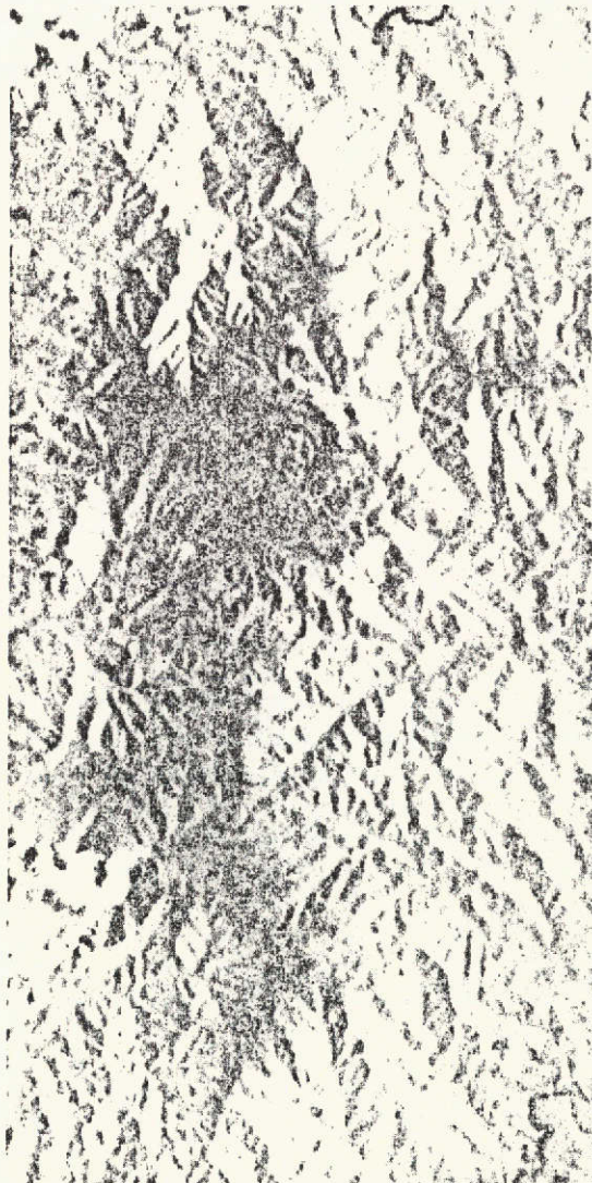
Figure 1. Photographic positive copy of ERTS-1 imagery of 15 October 1972 over the crest of the Great Smoky Mountains.