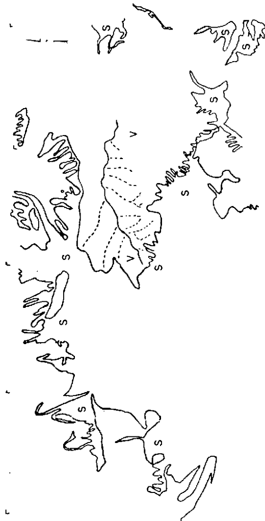
Figure 2. Sketch of boundary of mountain crest area chiefly in spruce forest (S). Big Creek valley is also outlined (V).