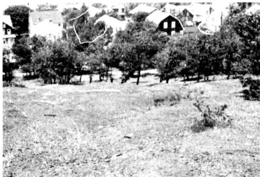
Figure 2: A sassafras-oak-black gum area, showing the characteristic lack of undergrowth.