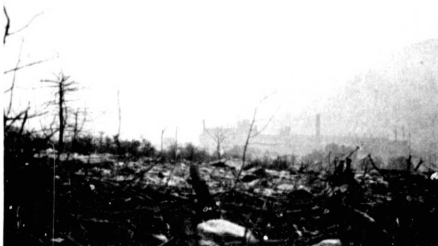
Figure 1: View of the smelter from Stony Ridge. In the early morning, when wind speed is very low, haze is often present and the odor of sulfur dioxide is distinct.