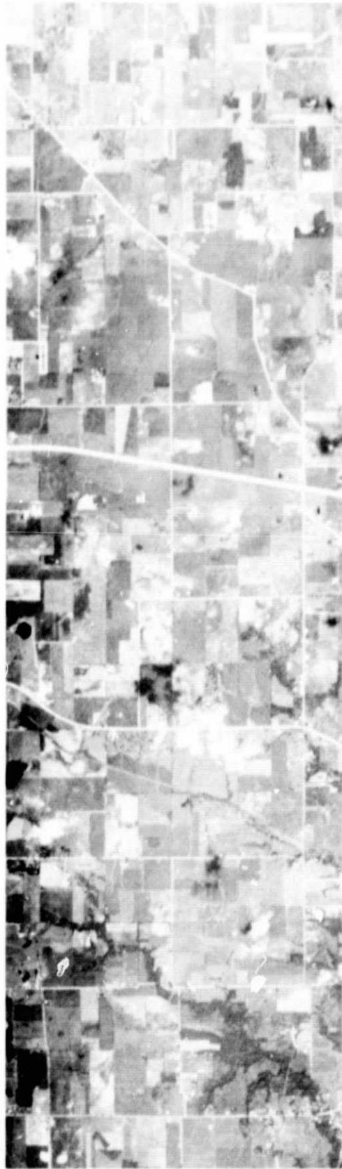
Figure 3. Aerial photo of area in Figure 2 showing the desired image geometry.