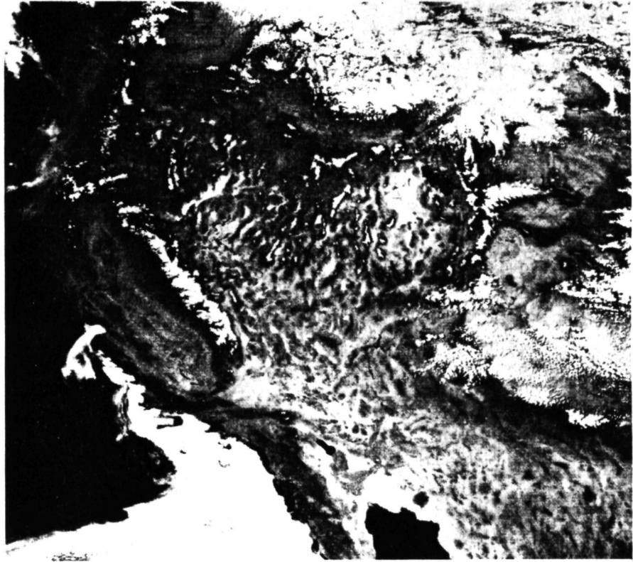
FIGURE 1 - HALF MILE VISUAL SECTOR FROM SMS-2

↑ 21:45 25MY75 32A-H 02131 18811 SA38N115W