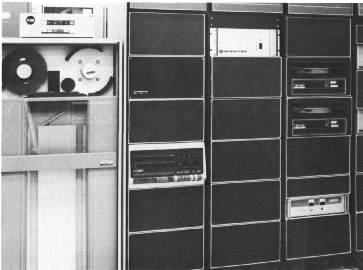
Figure V-2.— The PDP 1145 minicomputer used in the screwworm eradication data system and elsewhere.

Because Landsat data are relatively new, one might suspect that many of the data requests represent curiosity rather than actual use. Although curiosity is undoubtedly a factor, the table also shows a significant increase in requests for aircraft data as well. Aircraft data are not new; this data source has existed for many years.