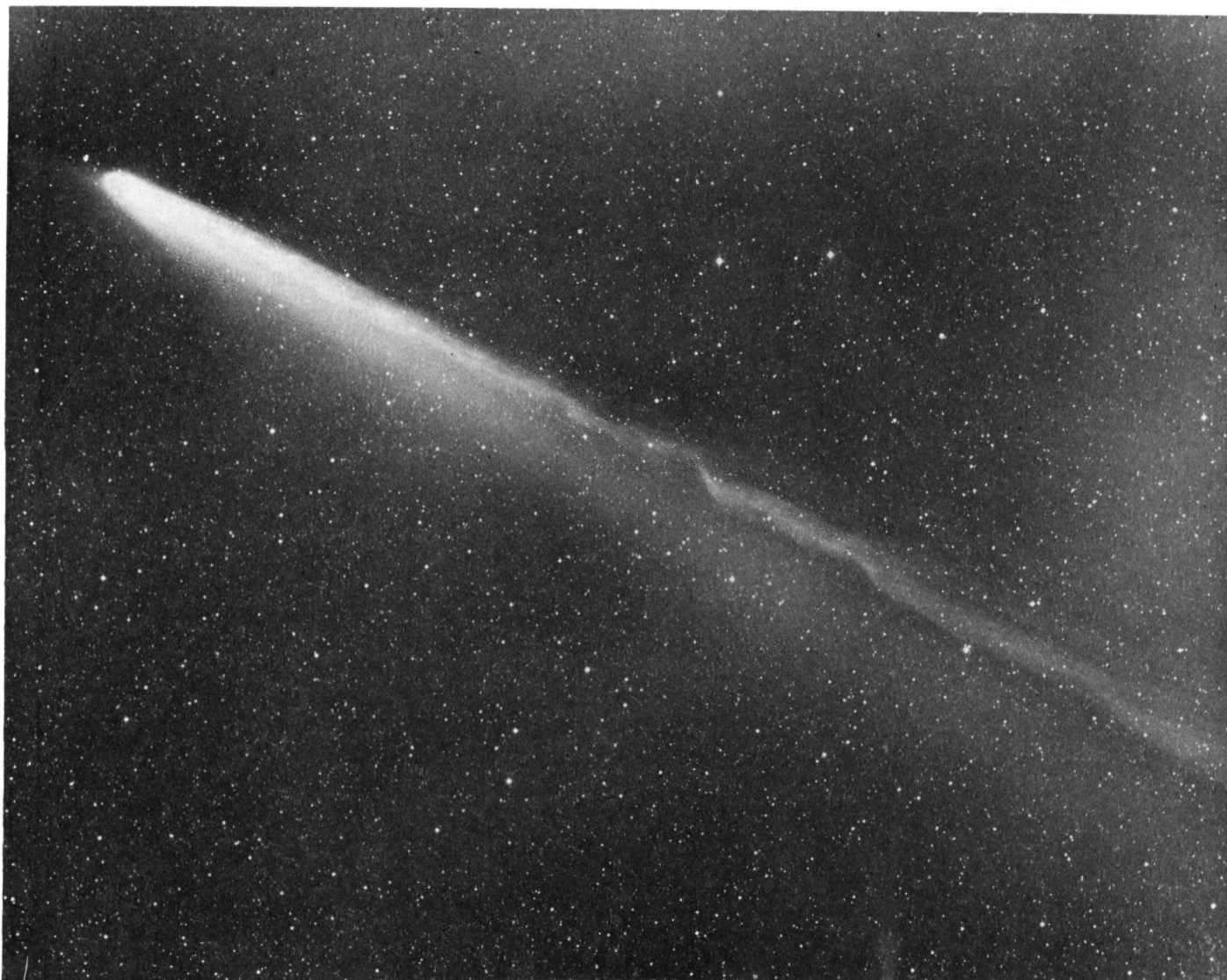
Figure 1. JOCR photograph of Comet Kohoutek on January 13, 1974. Compare with Figure 2.