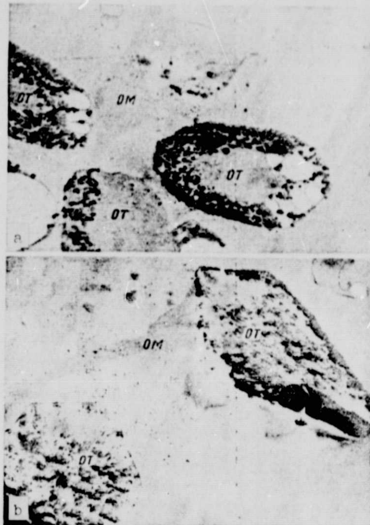
Figure 4: Otolith membrane (OM) and otoconiae (OT) from the control rat (a); otolith membrane and otoconiae from the rat subjected to the conditions of space flight for 19.5 days (b) Electronogram. Magnification: a-12,000 b- 10,000.

and the bright one, an organic ingredient of the otoconiae. Consequently, the redistribution of these substances suggests disturbances in the calcium metabolism within the otolith and the otolithic membrane. Such a surmise also follows from the observations made by us earlier (Ya. A. Vinnikov, et al., 1976) concerning the otoconiae and the otoliths of amphibians and fishes, and also from the data in the literature concerning the dynamics of the calcium exchange in the otoconiae of the otolithic membrane in mammals in general and in rats in particular (Lim, 1974, 1973; Ross and Peacar, 1975).