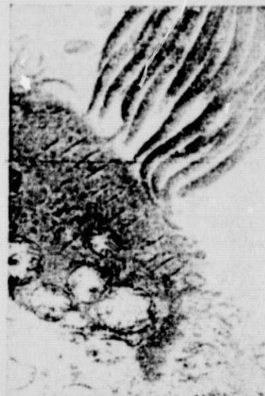
Figure 5: Cupula in the crista of the horizontal canal is pulled off (the rat subjected to the conditions of space flight for 19.5 days). Microphoto. Magnification: oc. 7 ob. 10