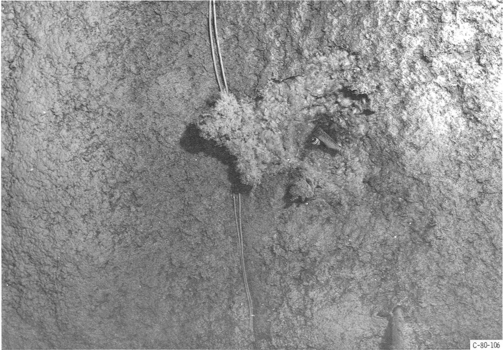
Figure 2. - Damaged ceiling insulation.