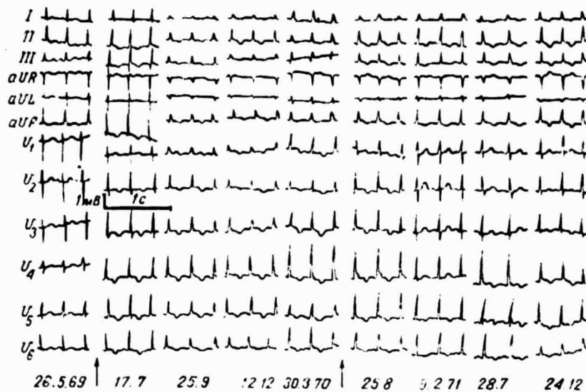
Fig. 1. The Dynamics of EKG Changes in Hamadryad Baboons. Arrows correspond to periods of stress action. Recording dates below.