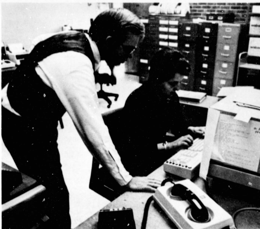
Specialists processing a databank search for information for an industrial client.

From North Carolina, NASA research is available for business application.