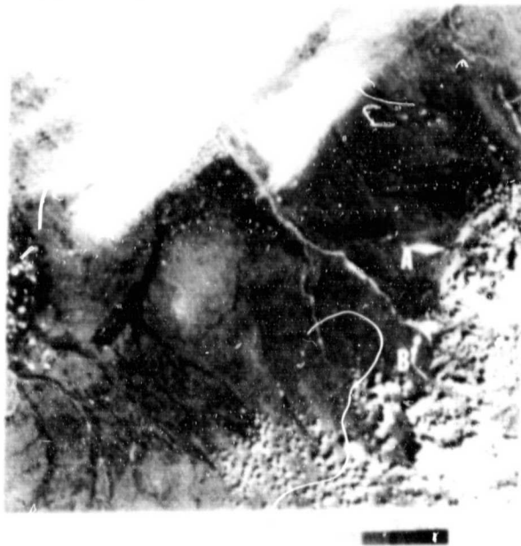
Figure 1. Landsat MSS Band 5 (Visible) Image Showing Large River Aufeis in Northeastern Alaska. Area "A" is Aufeis on the Echooka River; Area "B" is Aufeis on the Saviukviayak River

Distribution of aufeis was determined from Landsat Band 5 (visible) imagery. The visible Landsat bands are best for determination of aufeis extent because in spring and summer good contrast exists between the aufeis and the surrounding snow-free tundra (Figure 1). The aufeis fields were transferred from Landsat images onto 1:250,000 scale U.S.G.S. topographic maps using a Zoom Transfer Scope and then measured using a dot grid for the years 1972-1979. When interannual variations in aufeis extent were compared with the meteorological variables which are