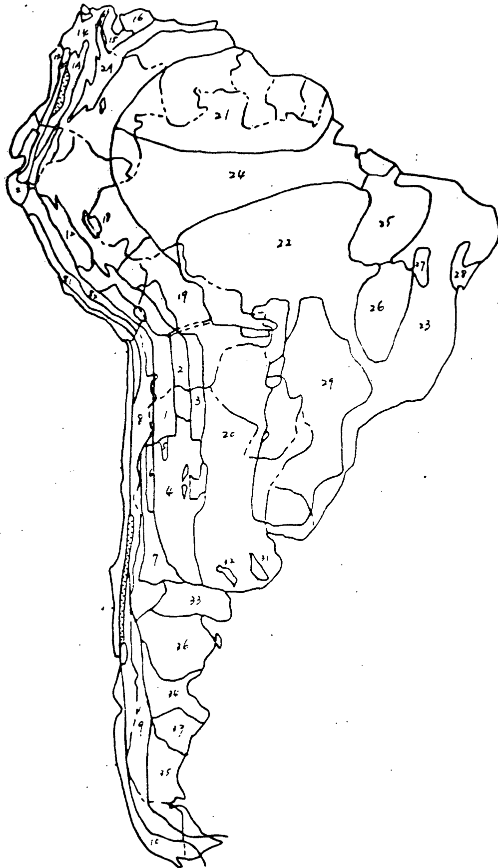
PRELIMINARY GEOLOGIC/TECTONIC MAP OF SOUTH AMERICA