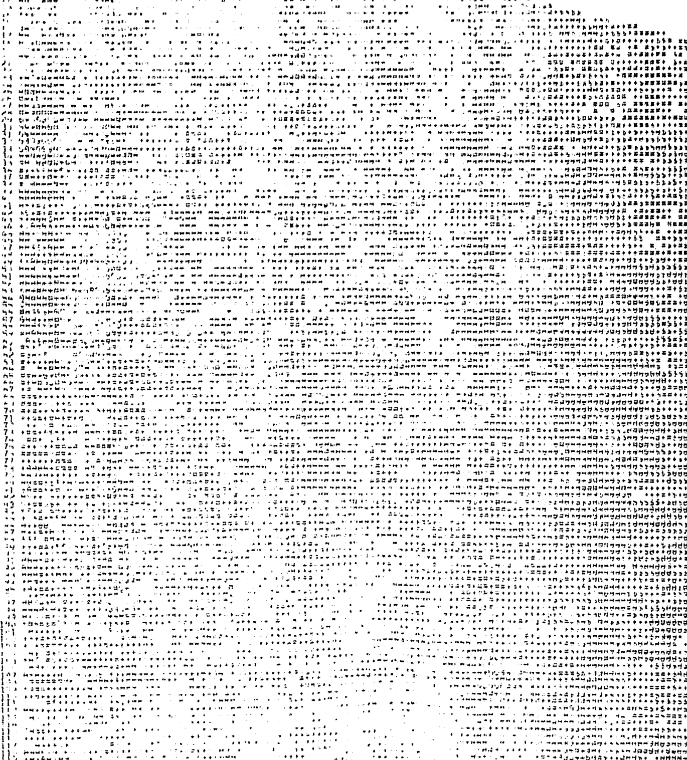
Figure 4. - The Registered MDP Image