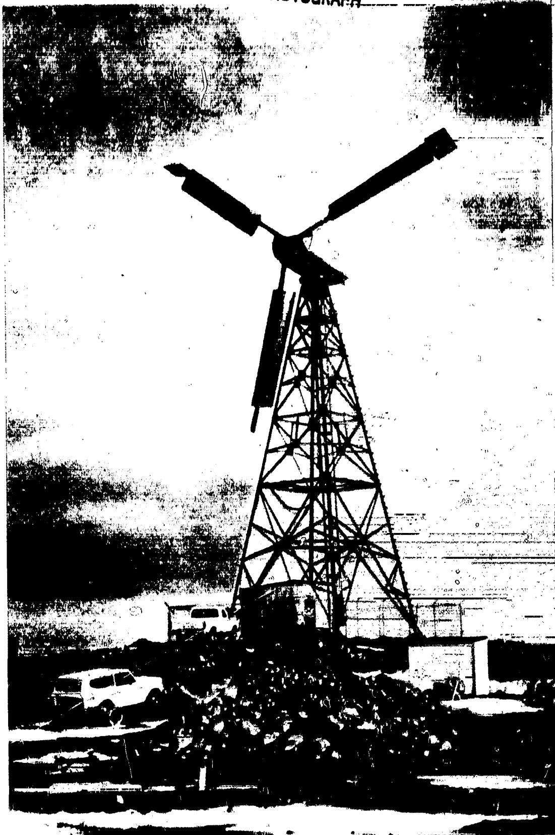
MP2-200 Nova Scotia Power Corp. Wreck Cove, NS

ORIGINAL PAGE BLACK AND WHITE PHOTOGRAPH