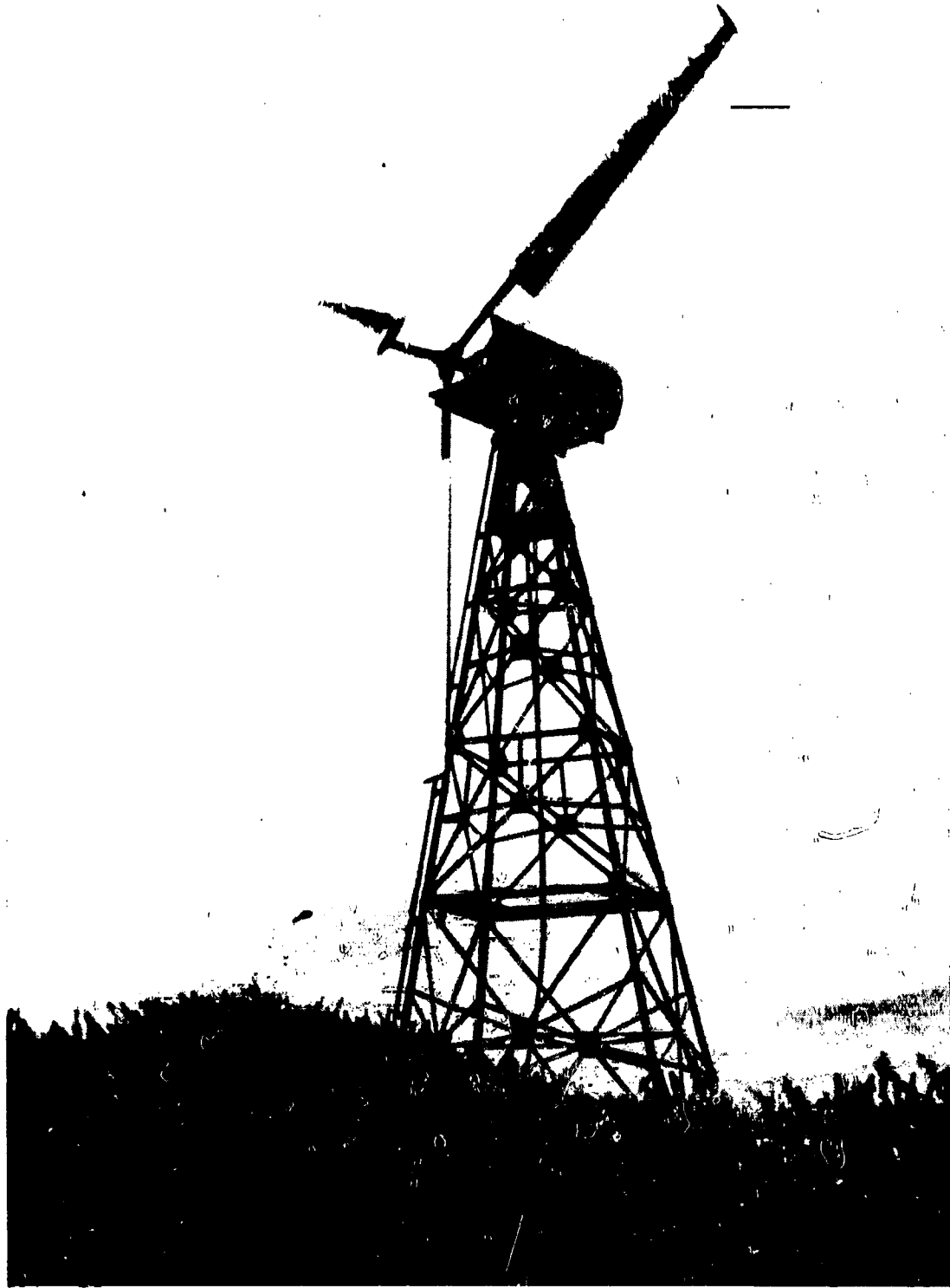
MP3-200 Pacific Power & Light Whiskey Run, OR

ORIGINAL PAGE BLACK AND WHITE PHOTOGRAPH