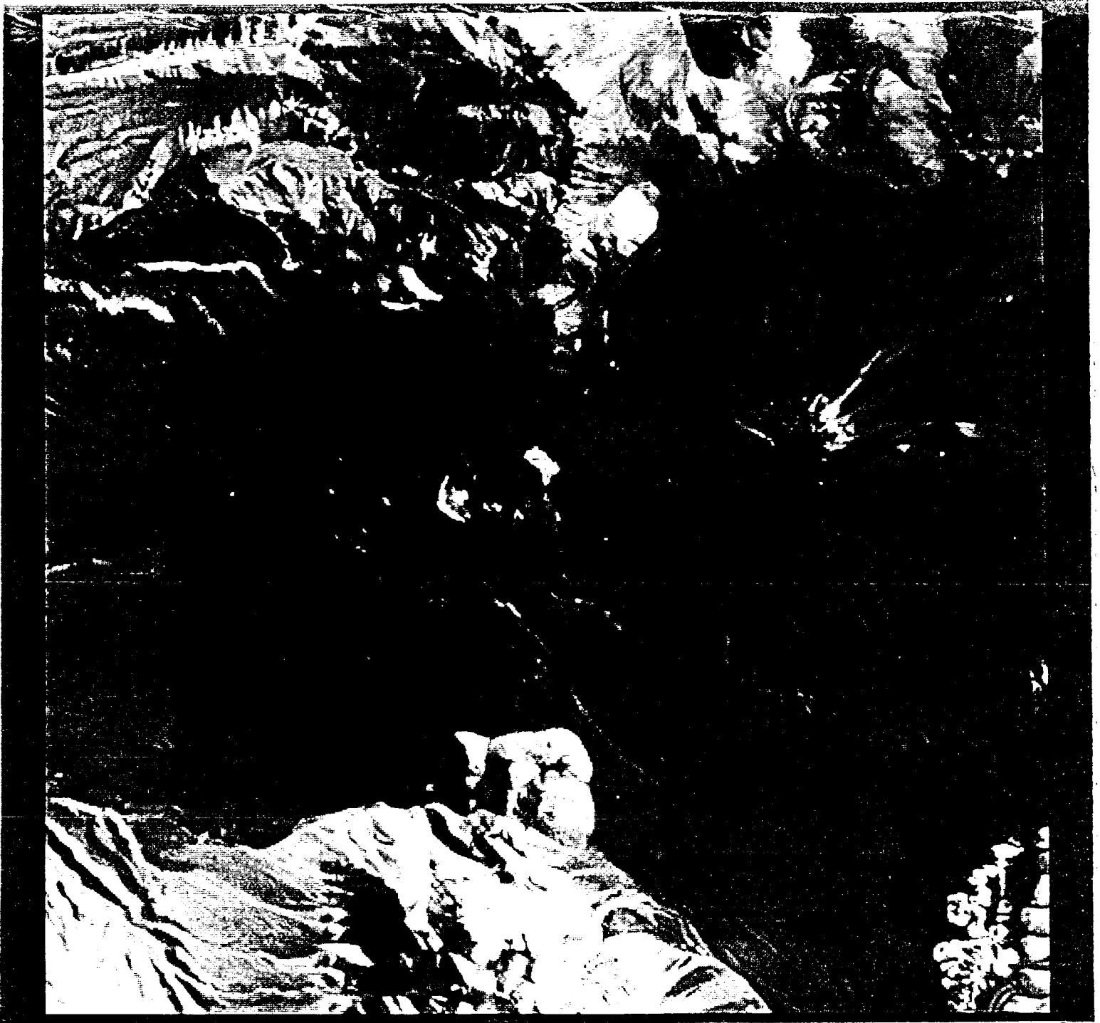
Landsat Thematic Mapper (Band 5) image of Lascar volcano, north Chile. Image is 15 km across. Thermal anomaly is white spot at center of summit crater complex. Measured temperatures are approximately 360°C. Image acquired March 1985