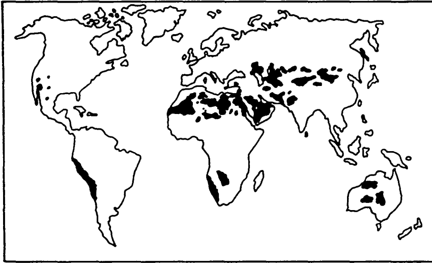
Fig.1. Distribution of major low latitude sand seas.