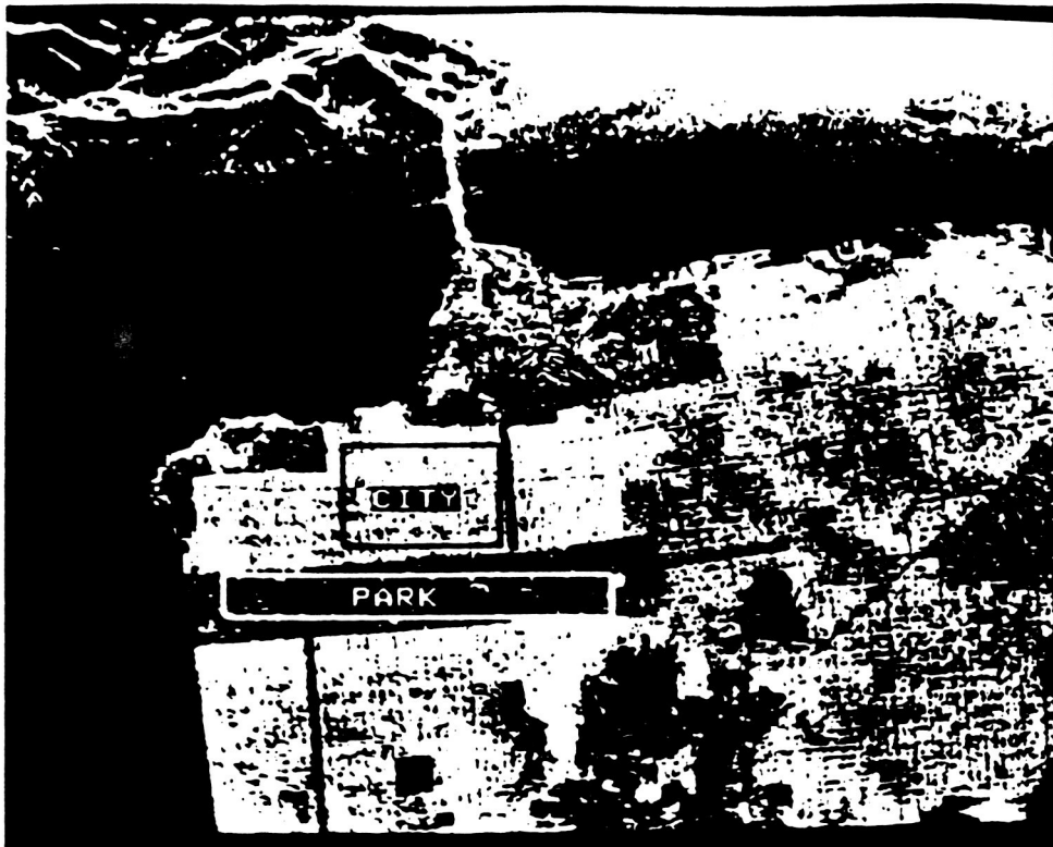
Figure 2 Training areas used to generate the covariance matrix elements for the park and urban (city) regions, shown in table 1.