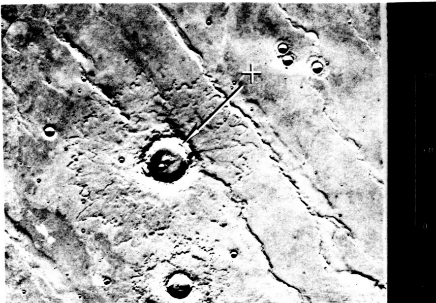
Figure 3. Ridges and fluidized craters in the Coprates region of Mars. Suggested landing site (+) and sampling traverse (arrow) are shown. (Viking frame # 608A45).