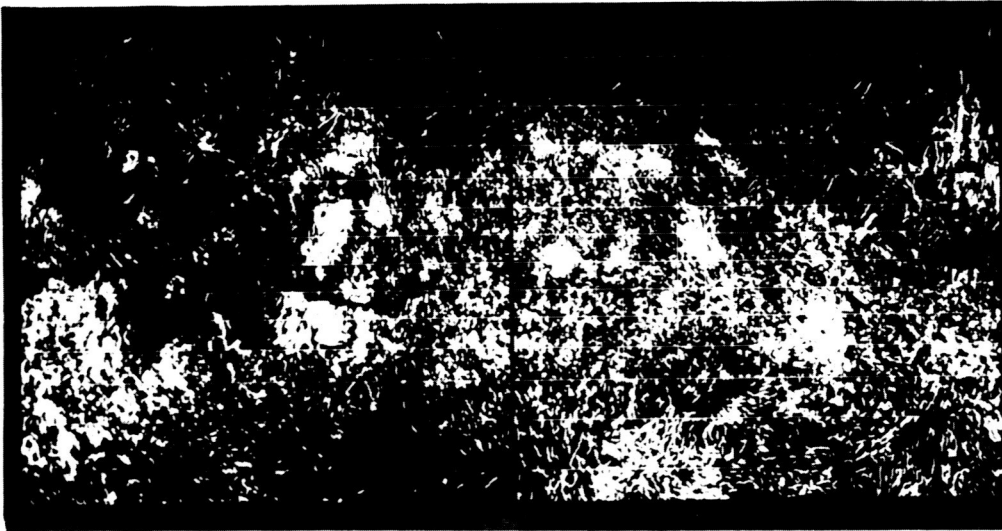
Figure 1. Computer-based map of all ridges on Mars, between latitudes of \pm 65^\circ .