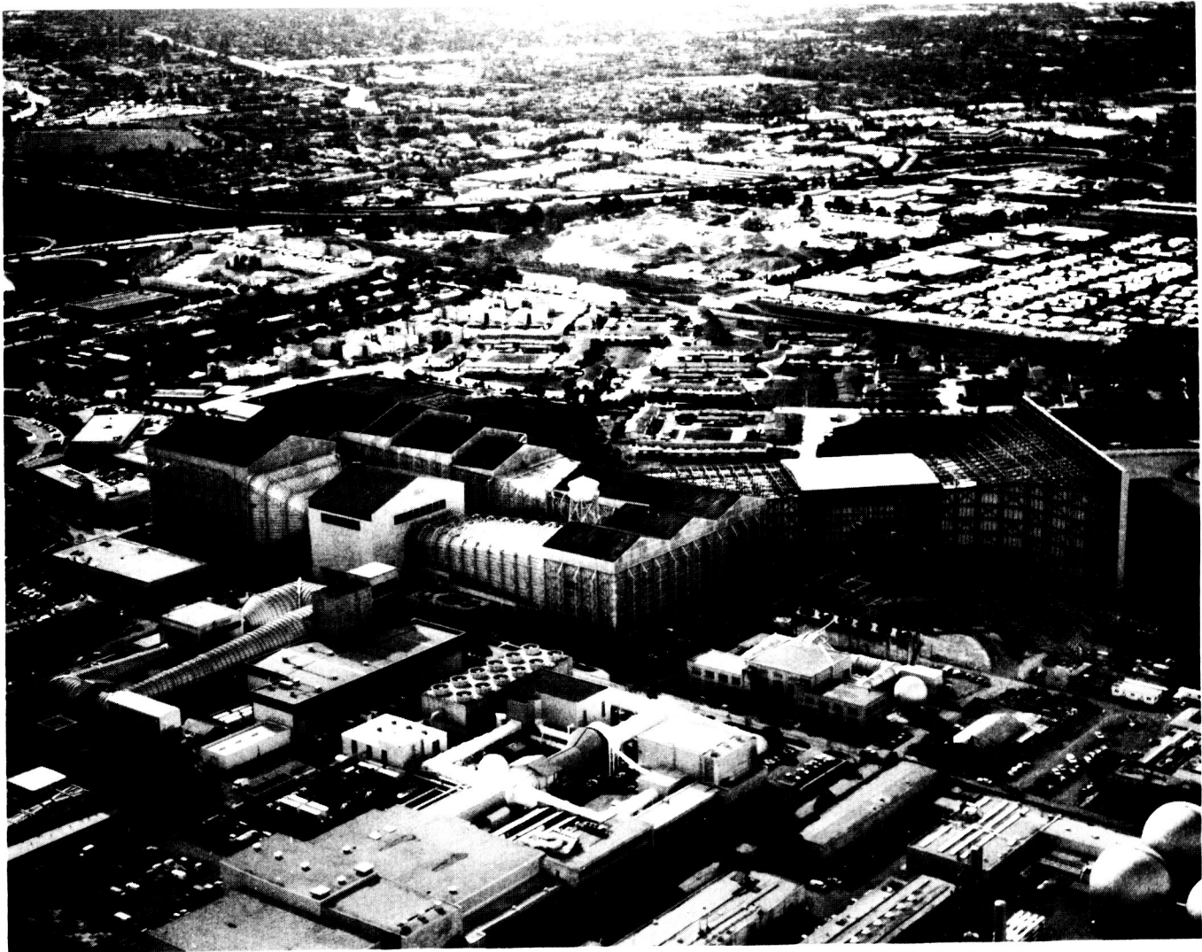
Figure 1.- The NFAC complex is a dominating structure at NASA Ames. The 80- by 120-Foot Wind Tunnel can be seen on the right extending from the 40- by 80-Foot Tunnel.