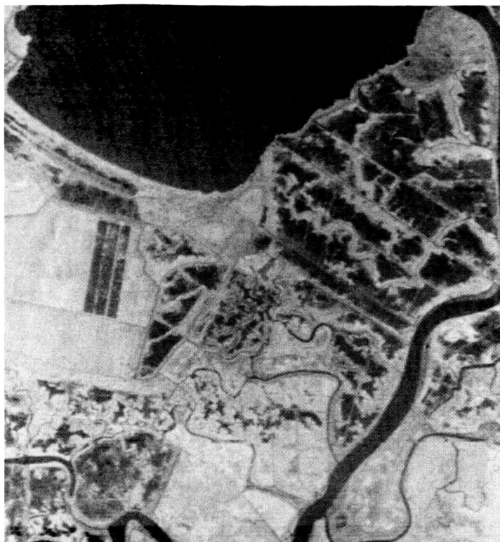
Figure 2. Band 68 (1.06 \mu m) after radiometric rectification.

mowed tules, senescent unmowed tules and Typha (cattails), a flooded area of senescing Scirpus paludosus (alkali bulrush), a sparsely vegetated area, two soil areas, and water. These spectra were stored in a library. To better distinguish vegetation spectral features from atmospheric features, all vegetation spectra and one of the soil spectra were multiplied by 50 and then divided by the other soil spectrum using the FUNCTION program (the spectral response of the soil was assumed to approximate that of a flat field).