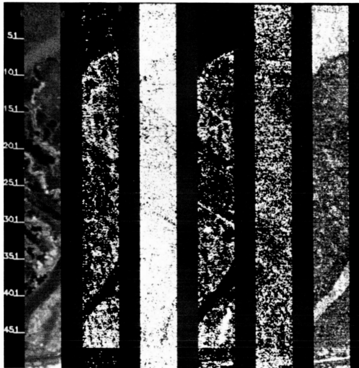
Figure 4. Results of MIXTURE analysis, using four spectra (senescent vegetation [column 2], flooded senescing S. paludosus [column 3], green S. verrucosum [column 4], and sparse senescent vegetation [column 5]). Column 1 is the raw image (0.67 \mu m), and column 6 is the residual, or pixels whose spectra do not match any of the four spectra. In this case, the residual pixels correspond to water.

Another program that created accurate output was FIND. This program locates all pixels matching a user-defined spectrum within user-supplied allowable deviations in slope and amplitude. The procedure can be repeated for several spectra in one image. In contrast to MIXTURE, FIND works on only one spectrum at a time (i.e., it does not compare all spectral classes with each other and assign pixels to the most likely class). FIND accurately located all Sesuvium and other lush green pixels based on the 0.67-0.72 \mu m spectral values. When spectra from several cover types were supplied, reasonably accurate results for this spectral region were obtained, after some manipulation of allowable spectral deviations. Likewise, results were satisfactory when spectra from four spectral regions (0.67-0.68, 0.74-0.76, 1.50-1.52, and 1.56-1.58 \mu m) of six cover types were used as input. Other spectral regions were not tested.