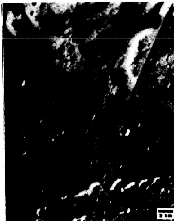
Figure 3. Pristine, small ridge which deform channel materials. Such ridges may be the result of overburden removal after channel formation. Viking orbiter photographs 665A35-38 with resolutions of 35 m/pixel.

ORIGINAL PAGE BLACK AND WHITE PHOTOGRAPH