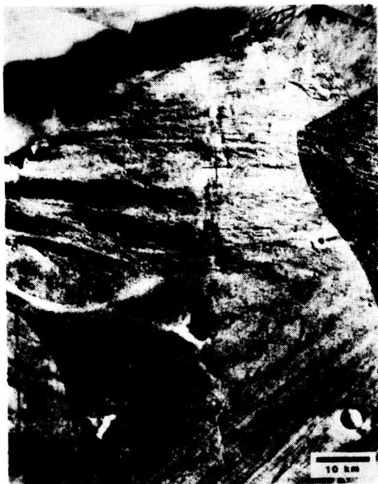
Figure 2. Heavily degraded first-order ridge on the floor of Kasei Valles. Viking orbiter photographs 226A07, 226A09, 226A11, 520A29, 665A40, 665A42, and 665A44. Resolutions range from 35 to 195 m/pixel.

ORIGINAL PAGE BLACK AND WHITE PHOTOGRAPH