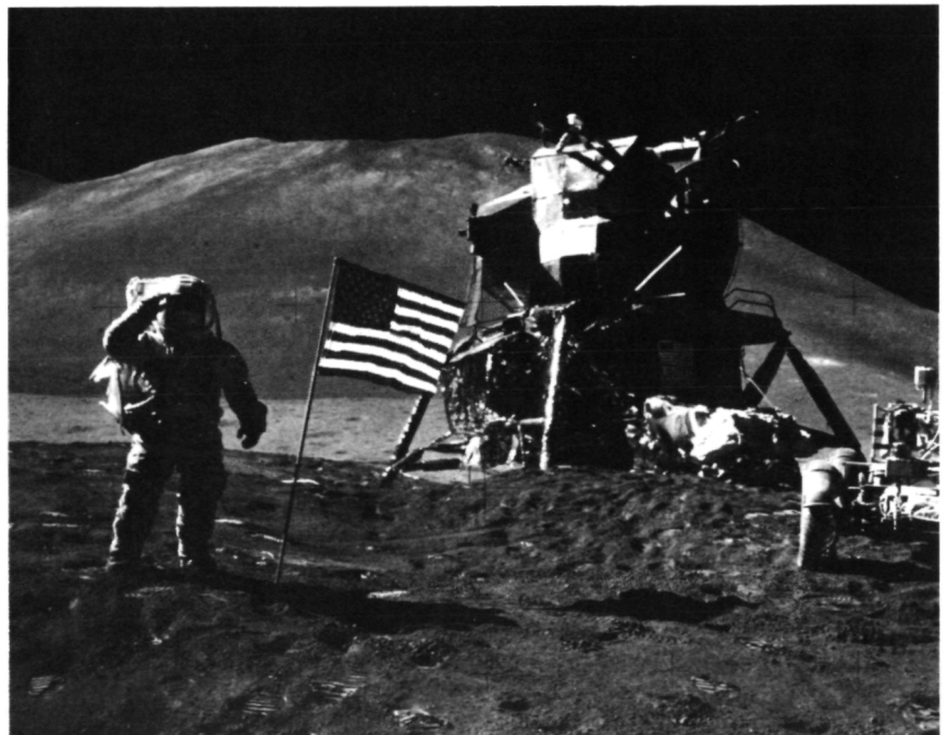
"Pioneering Space Exploration"

ORIGINAL PAGE BLACK AND WHITE PHOTOGRAPH