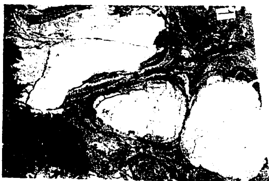
Fig. 6. Landsat image portraying three granitoid plutons and intervening volcanic and sedimentary Pilbara Supergroup. The latter originally accumulated in interpluton troughs and were deformed as the plutons intruded. Scene is 150 km left to right.

produce an increasingly graded topography, including mafic volcanism and fluvial and lacustrine processes [9,10]. By 2500 m.y. ago the region had evolved to a tectonically fairly stable marine platform or continental shelf inundated by an epeiric sea, and was dominated by deposition of evaporites (banded iron formation and dolomite) [9,12]. By the end of this phase, the region had acquired essentially its present configuration, although the Pilbara Craton possibly may not have been integrated with the rest of Australia.