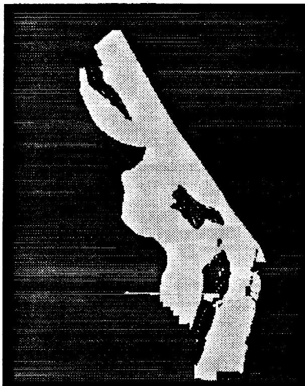
Figure 3.1 Areas with High Potential for Point Source Groundwater Contamination and Primary or Secondary Aquifer Recharge

One should keep in mind that the SEEPAGE results are based only on hydrologic factors and do not consider groundwater recharge locations, distances to water uses, aquifer water use volume, land uses, contaminant locations, contaminant characteristics, or potential for introduction of potential contaminants to the soil. One should also note that SEEPAGE does not provide information about potential for surface water contamination. However, based on SEEPAGE results, care should be taken when working with potential contaminants at KSC, especially in the areas with a high potential for contamination based on hydrologic factors that are located in primary or secondary aquifer recharge areas as shown in Figure 3.1.