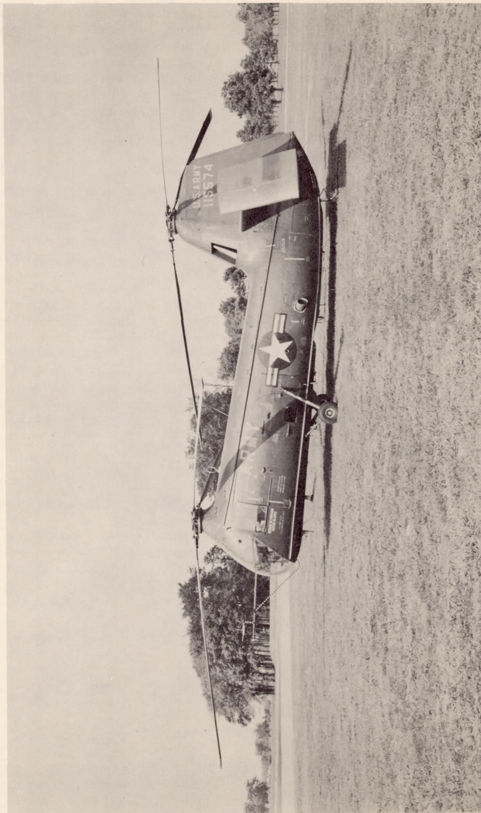
Figure 1.- Test helicopter.