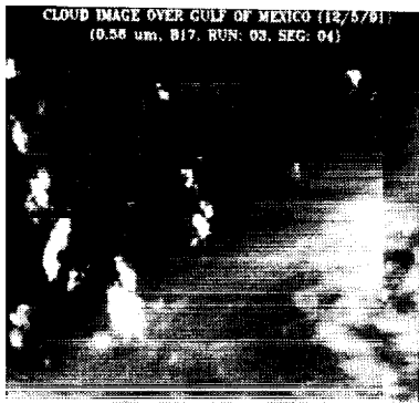
Fig. 3: A 0.56 \mu\text{m} AVIRIS image over the Gulf of Mexico. Both the upper level extensive cirrus clouds and the lower level smaller cumulus clouds are seen.