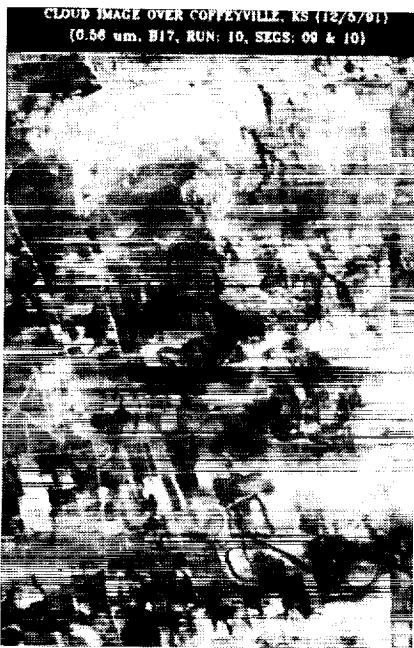
Fig. 1: A 0.56 \mu\text{m} AVIRIS image over Coffeyville, Kansas. Surface features are seen in this figure.