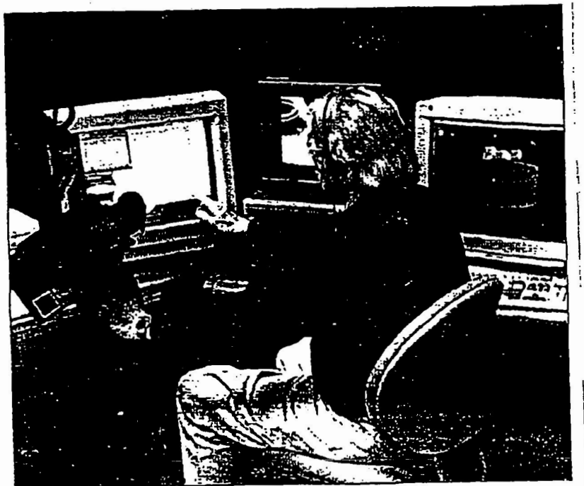
Figure 2: The VR-based multimedia training system.