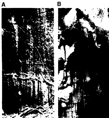
Fig. 1. (A) Radar-bright streak (top of image, associated with cone-shaped hill) and "zebra" streaks at 9°N, 67°E, north of Hestia Rupes. The wind is inferred to have blown from north to south at the time of streak formation. The largest bright streak is about 35 km long (Magellan F-MIDR 10N065). (B) Radar-dark streaks at 46°N, 127.1°E, in Northern Niobe Planitia. Part of Anake Terra is visible in the upper portion of the image. The wind is inferred to have blown from north (top) to south (bottom) at the time of streak formation. The longest streak is about 40 km long (Magellan F-MIDR 45N126).

Venusian eolian features, including wind streaks, require a supply of loose, small particles and winds of sufficient strength to move them. Although wind streaks occur at all latitudes (Fig. 2A) and longitudes on Venus, most streaks are located in association with ejecta deposits from craters. In a few areas, material may be weathered from tectonically disrupted ter-