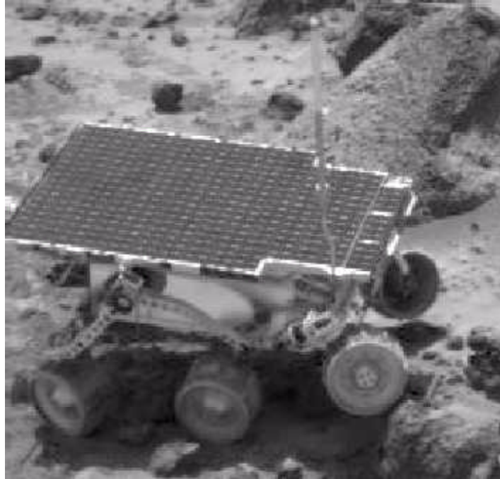
Sojourner rover on sol 41. Dust is uniform on the wheel drive surface. (Wheel detail is obscured.)

We believe that this accumulation occurred because the Martian surface dust consists of clay-sized particles, similar to those detected by Viking, which have become electrically charged. By adhering to the wheels, the charged dust carries a net nonzero charge to the rover, raising its electrical potential relative to its surroundings. Similar charging behavior was routinely observed in an experimental facility at the NASA Lewis Research Center, where a Sojourner wheel was driven in a simulated Martian surface environment. There, as the wheel moved and accumulated dust (see the following image), electrical potentials in excess of 100 V (relative to the chamber ground) were detected by a capacitively coupled electrostatic probe located 4 mm from the wheel surface. The measured wheel capacitance was approximately 80 picofarads (pF), and the calculated charge, 8 \times 10^{-9} coulombs (C) (ref. 1). Voltage differences of 100 V and greater are believed sufficient to produce Paschen electrical discharge in the Martian atmosphere (ref. 2). With an accumulated net charge of 8 \times 10^{-9} C, and average arc time of 1 msec, arcs can also occur with estimated arc currents approaching 10 milliamperes (mA). Discharges of this magnitude could interfere with the operation of sensitive electrical or electronic elements and logic circuits.