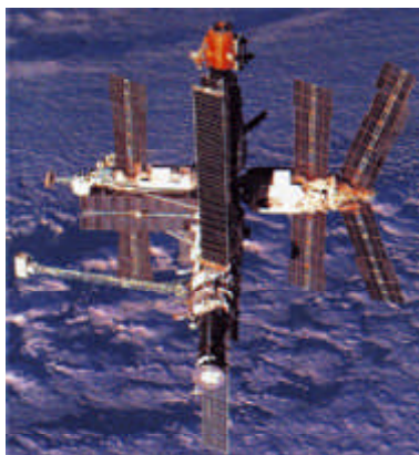
MCSA (foreground) deployed on Mir.

The Mir Cooperative Solar Array (MCSA) was developed jointly by the United States and Russia to provide approximately 6 kW of photovoltaic power to the Russian space station Mir. The MCSA was launched to Mir in November 1995 and installed on the Kvant-1 module in May 1996, where it has been performing well to date. Since the MCSA panels are nearly identical to those of the International Space Station (ISS), MCSA operation offered an opportunity to gather multiyear performance data on this technology prior to its implementation on the ISS. Initial, on-orbit electrical performance and temperature data were measured in June and December of 1996.